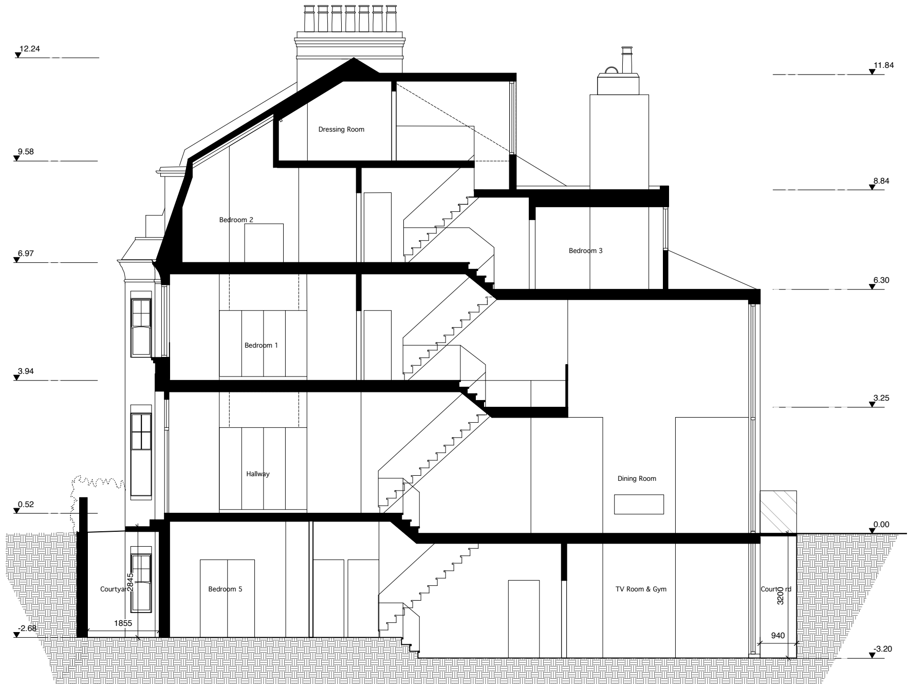
LONG SECTION - PROPOSED

brinkworth 6 Blenheim Street London E2 0AX T 44(0)20 7613 5341 F 44(0)20 7739 8425