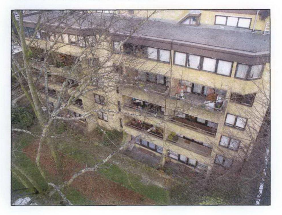
Figure 1. Front Elevation, 15 Belsize Av.

2.6. Photographs of Existing Style of Properties.