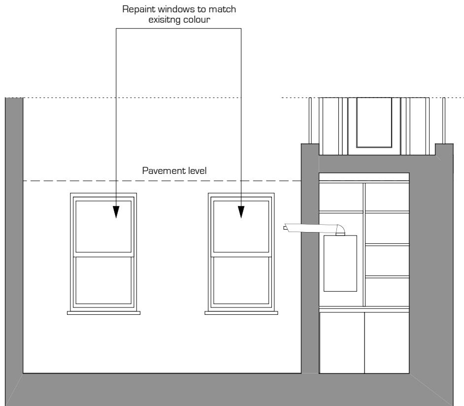
Proposed Front Elevation FF