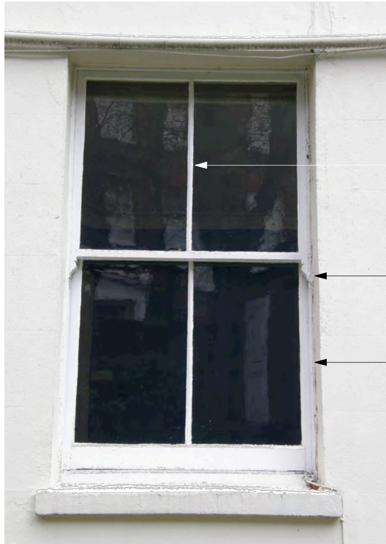
EXISTING REAR WINDOW EXAMPLE