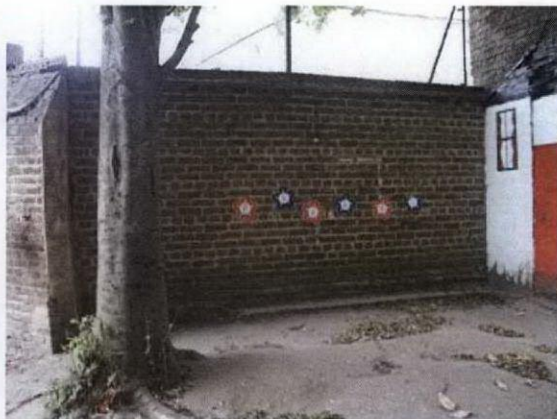
6. Close-up view of wall from inside of School.