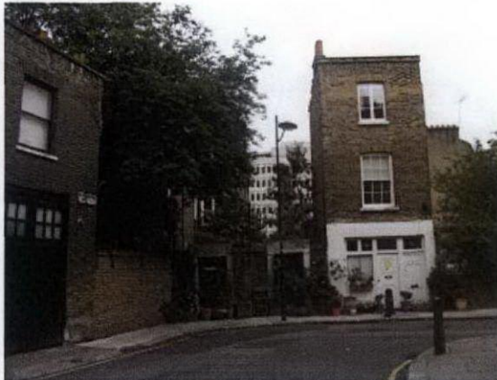
1. Whidbourne Street elevation.