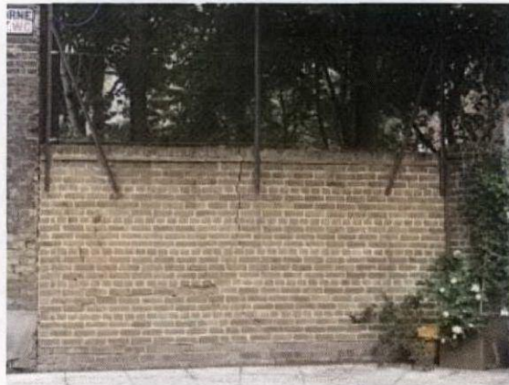
4. Close-up of section of wall to be re-built.