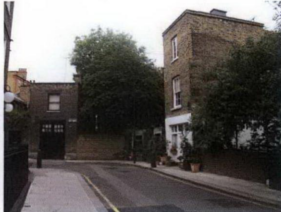
2. Whidbourne Street elevation.