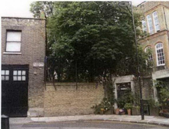
3. Section of wall to be re-built.