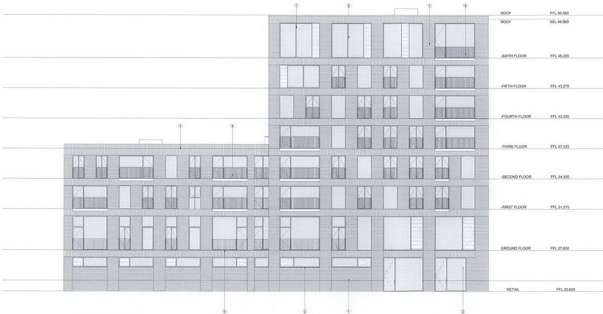
CANAL (SOUTH) ELEVATION