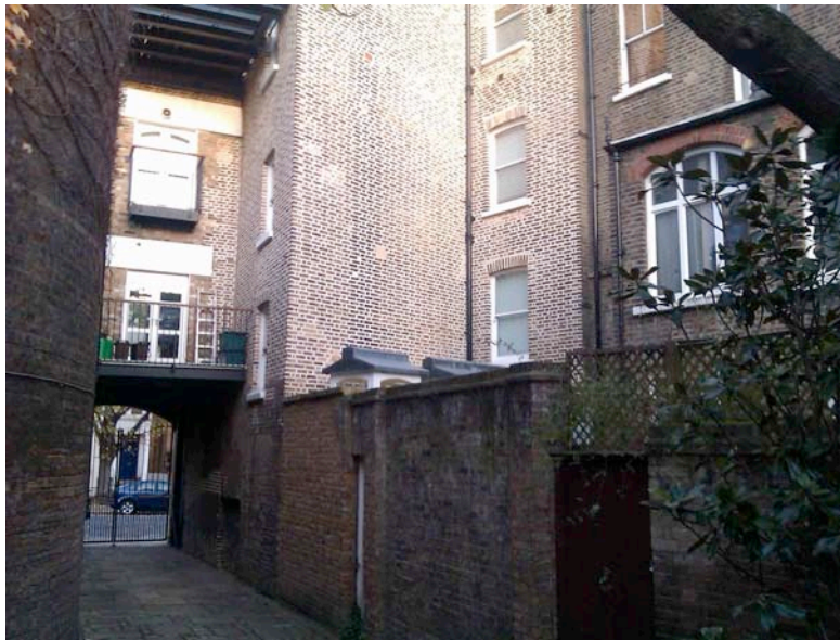
View from Eglon Mews