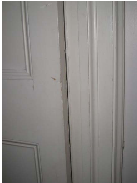
DR2 in B7