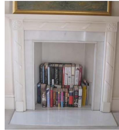
FP3 – in S-1: possibly original, moved from 14 Prince Albert Road