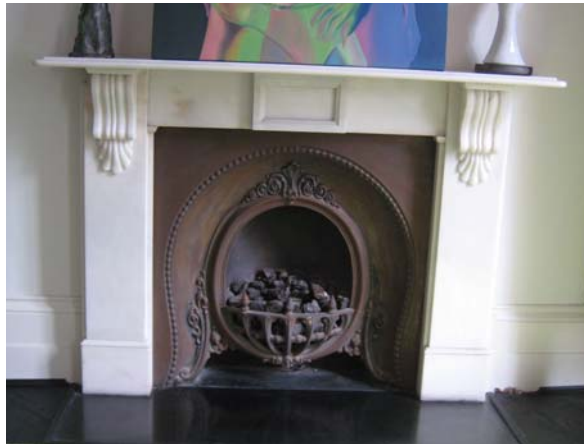
FP2 – in F-2 and F-3