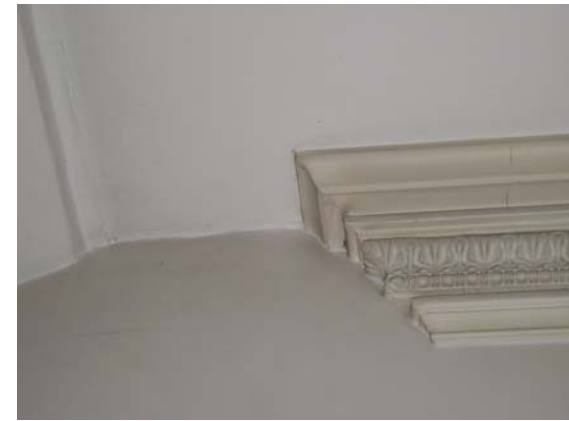
C3 in G-4