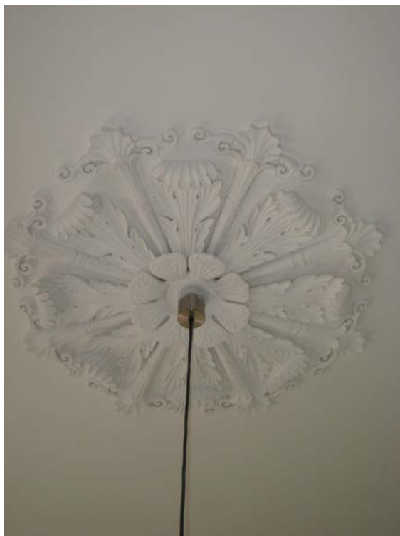
R1 – in F-2