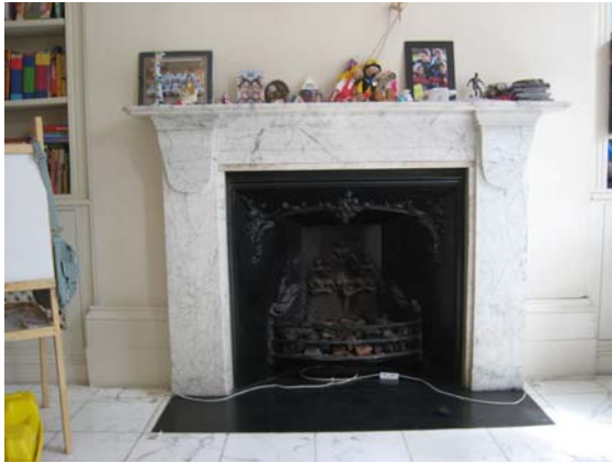
FP1 – in G-1: modern reproduction