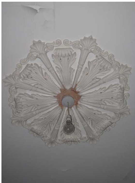
R1 – in F-3, but missing centre florets