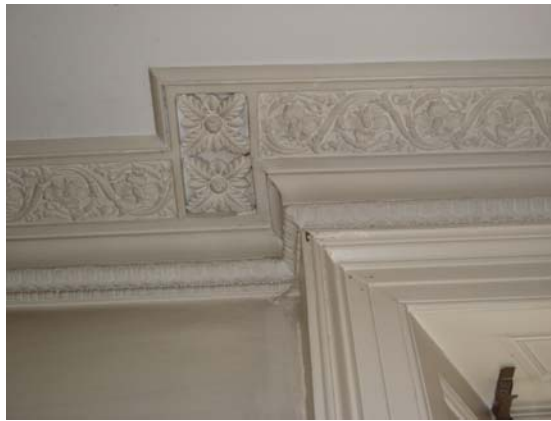
C2 in G-1