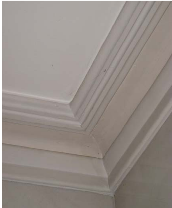
C5 in S-3