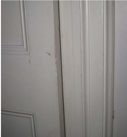
AT1 in LG-7