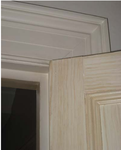
DR43 detail view in G1