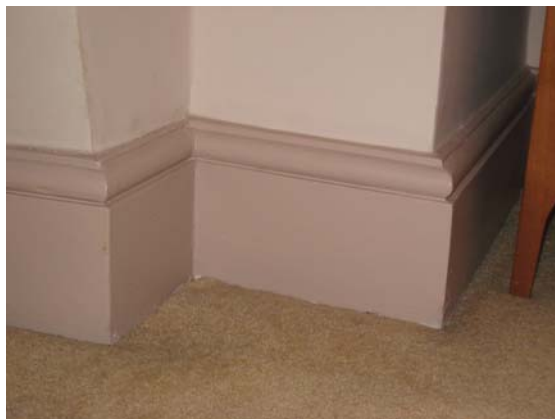
Sk1 in T-1