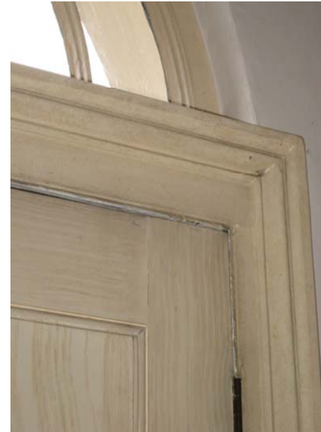
DR4, front door, detail view in G3