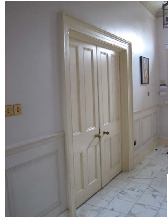
DR3 in G3