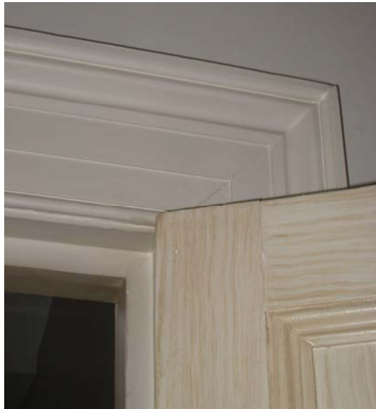
AT2 in G-1