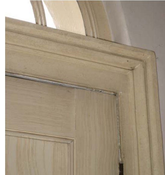
AT3 in G-3