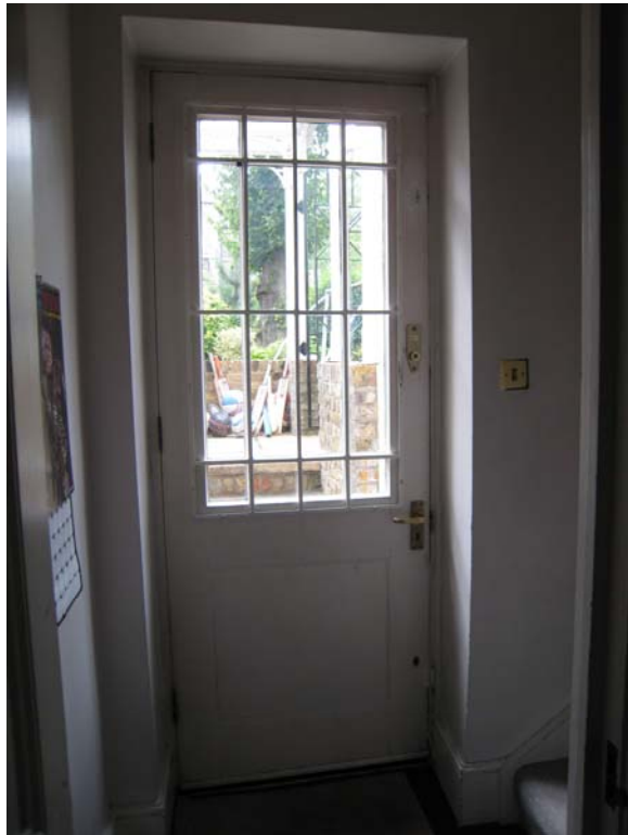
DR1 in LG8