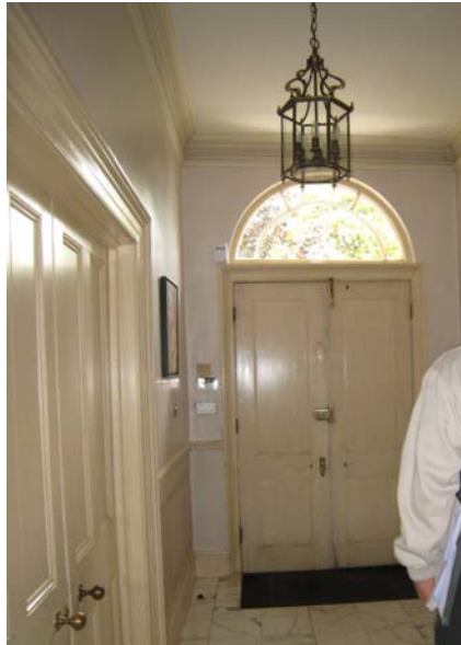
DR4 general view in G3