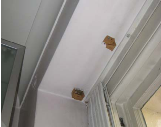
C1 in LG-6