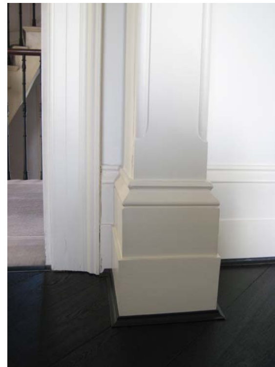
Sk3 in F-1