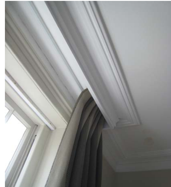
C6 in S-2