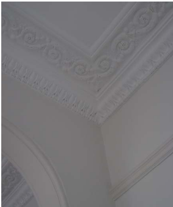
C4 in F-2