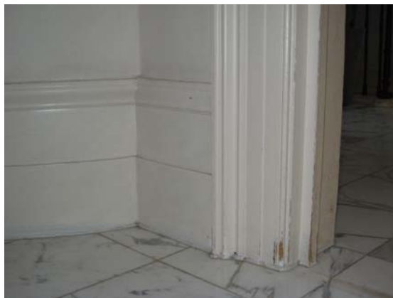
Sk2 in G-2