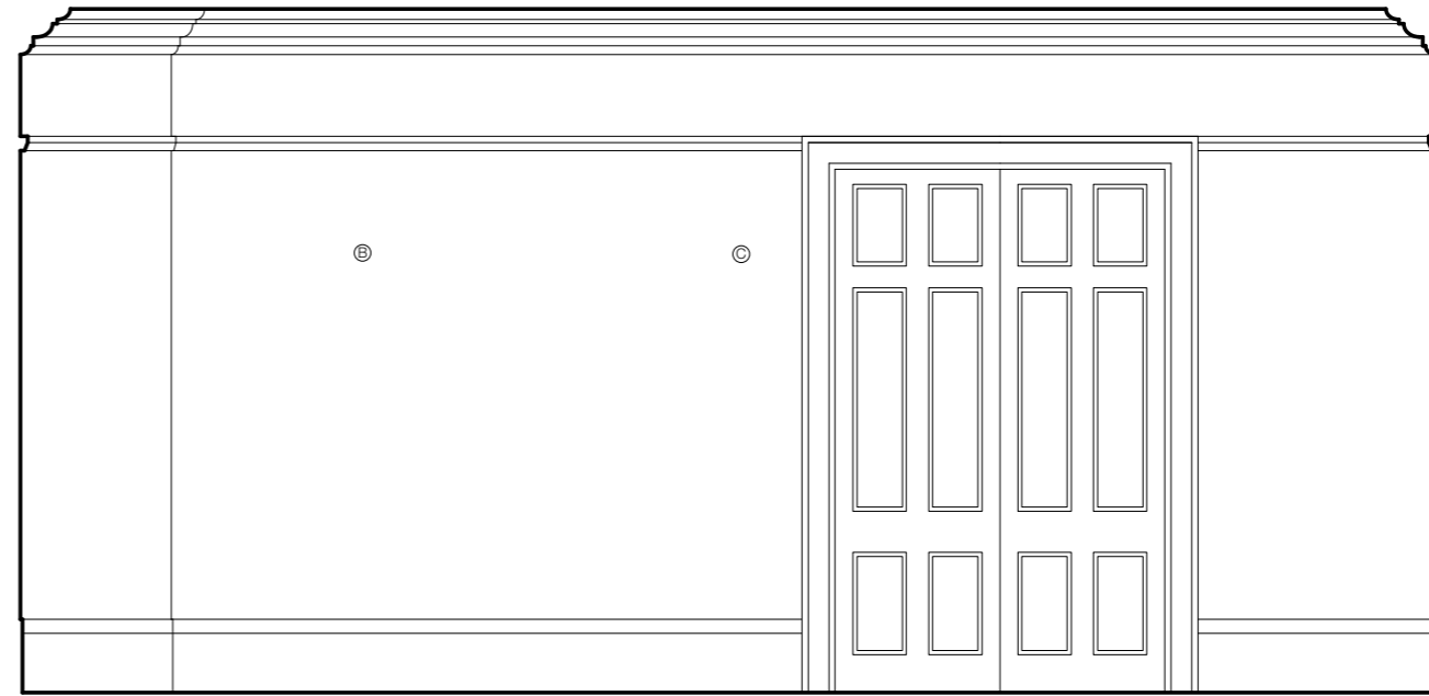
Proposed Living Room Elevation - looking at door into proposed dining room