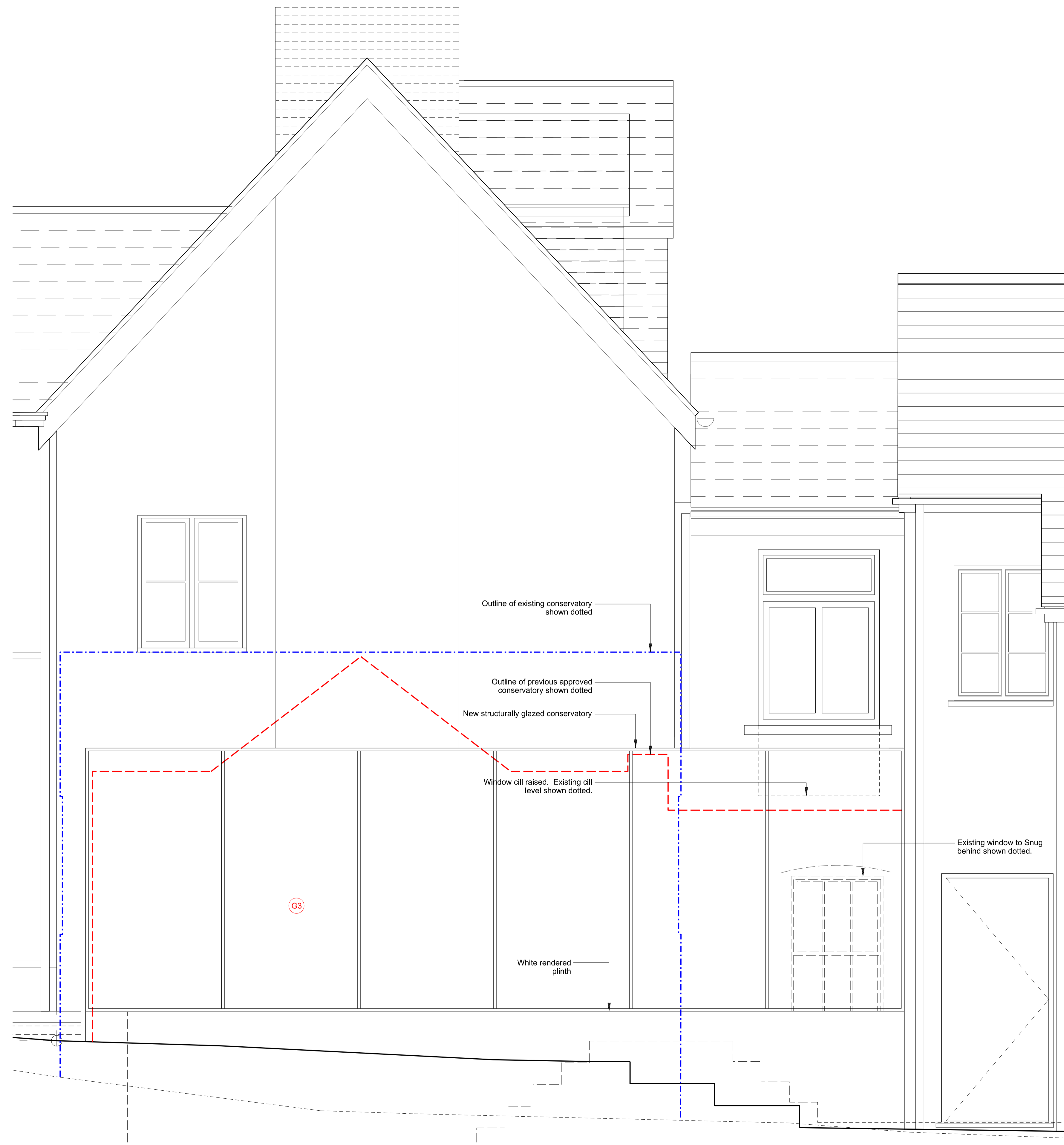
02 EAST ELEVATION D211 PROPOSED 1:20