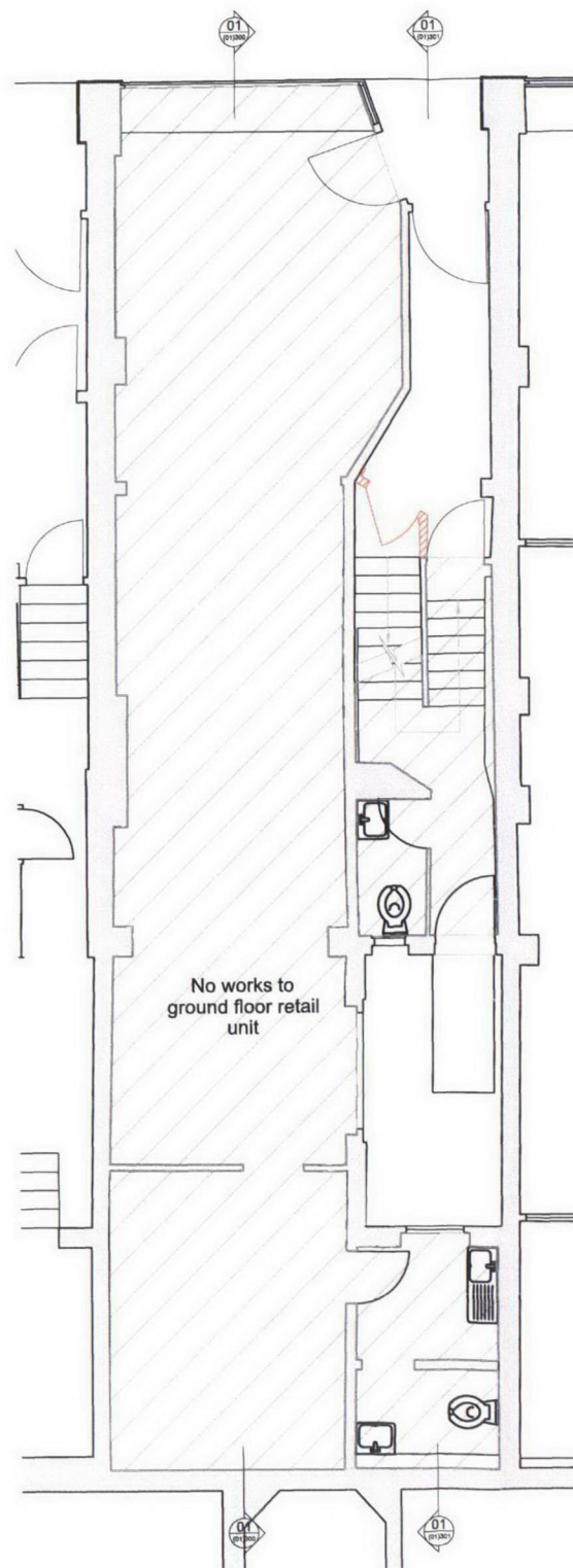
01 (01)140 GROUND PLAN As Existing