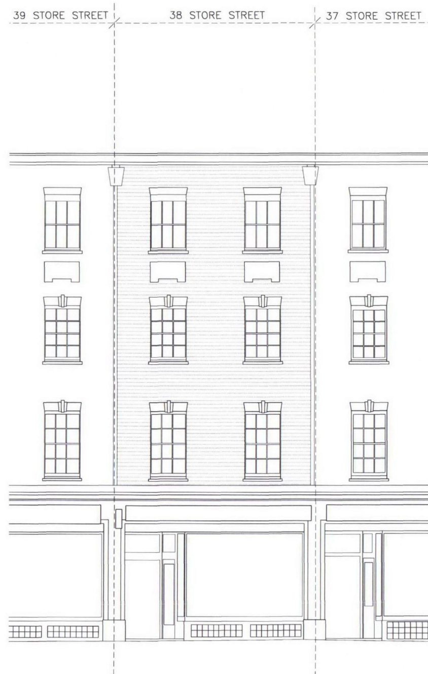
01 (01)240 FRONT ELEVATION As Existing