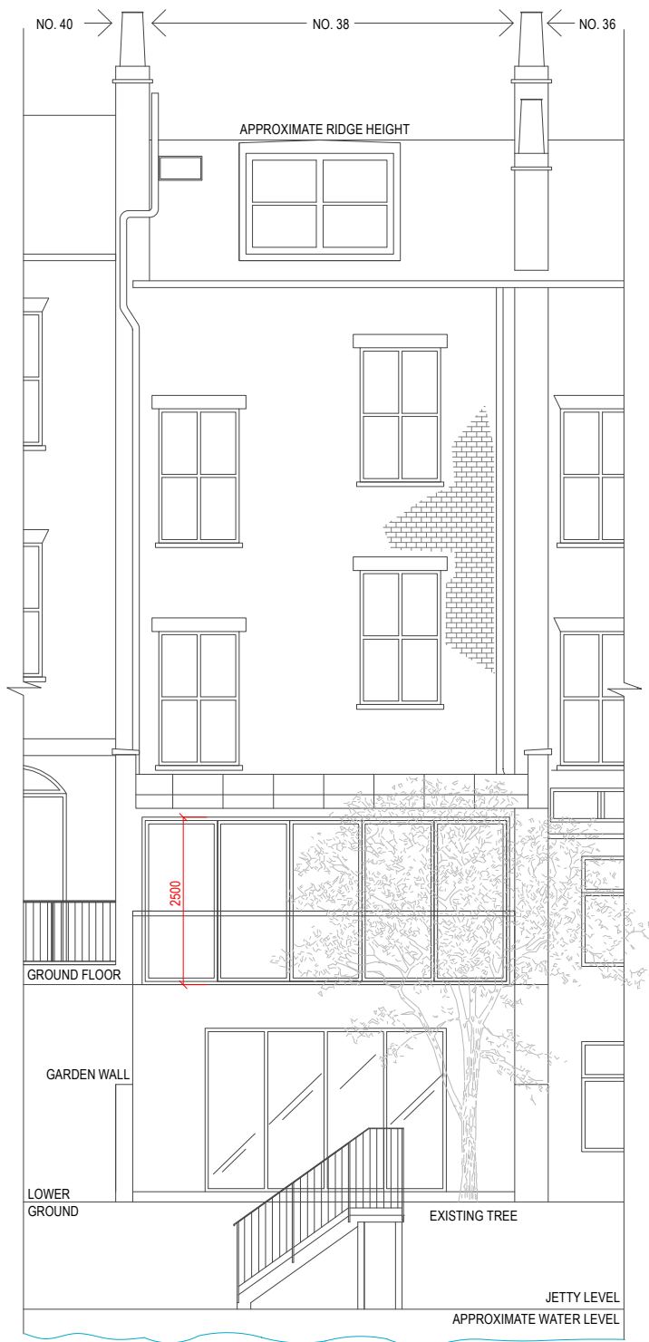
REAR ELEVATION 1:50@A1