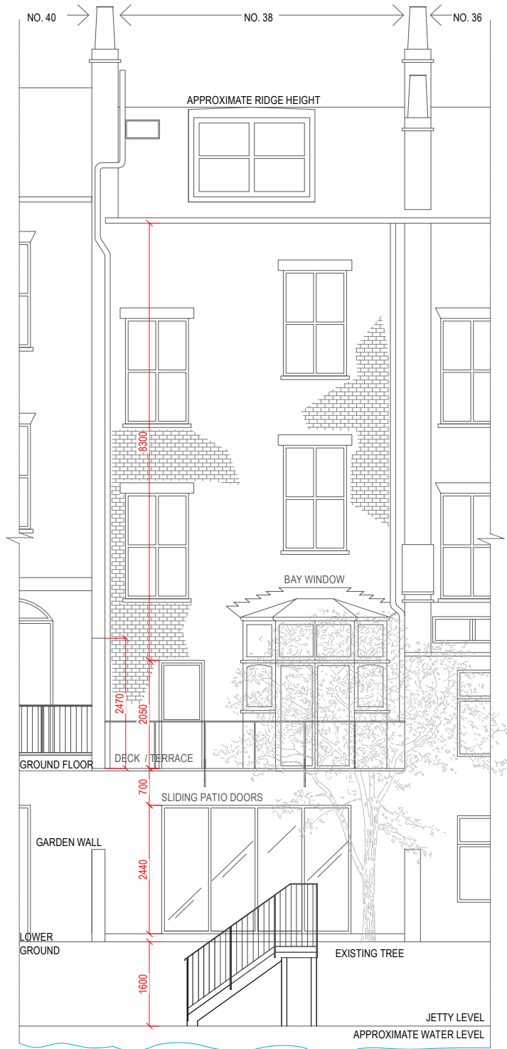
EXISTING REAR ELEVATION 1:50@A1