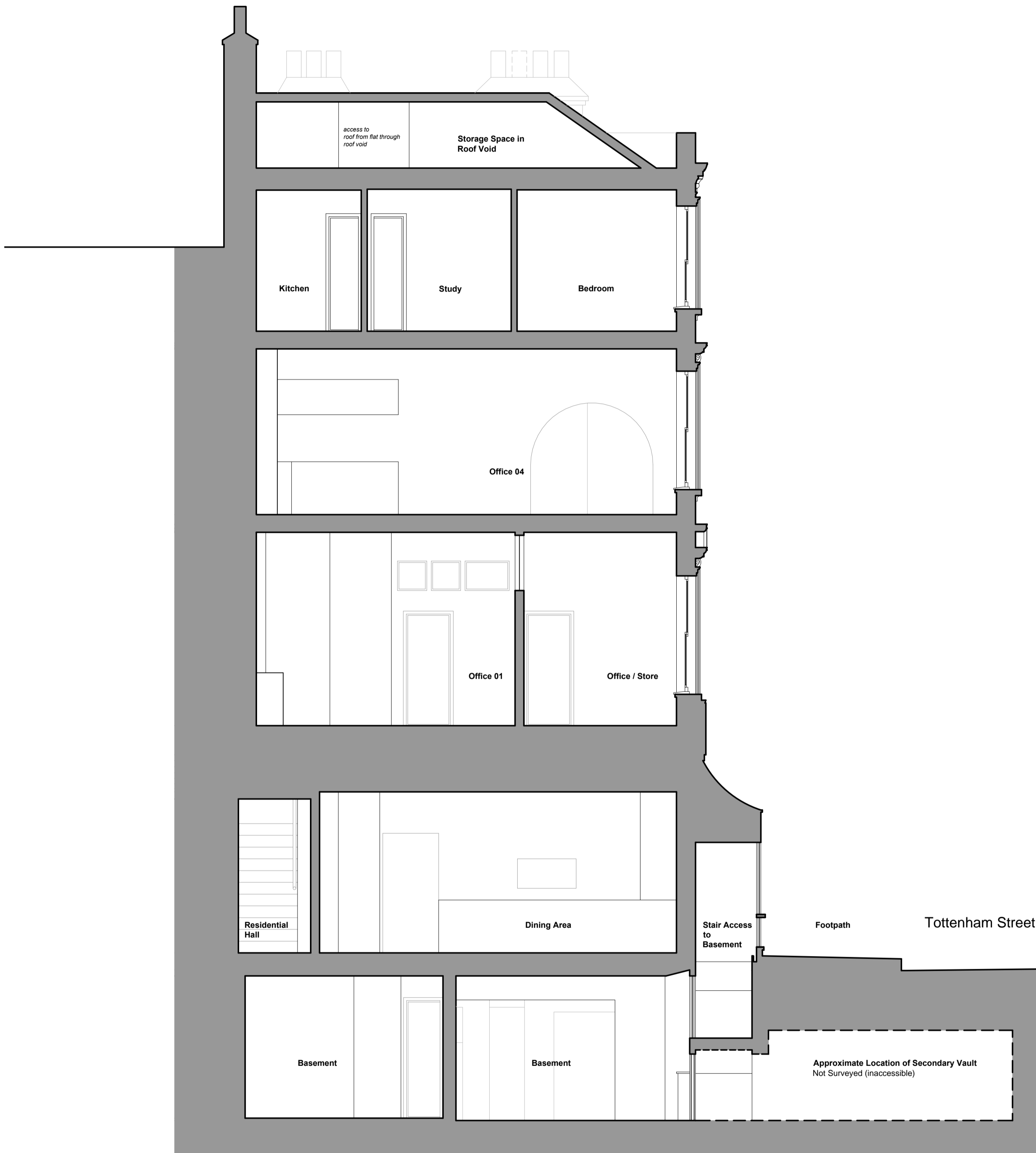
Cross Section A-A 1:50 @ A1