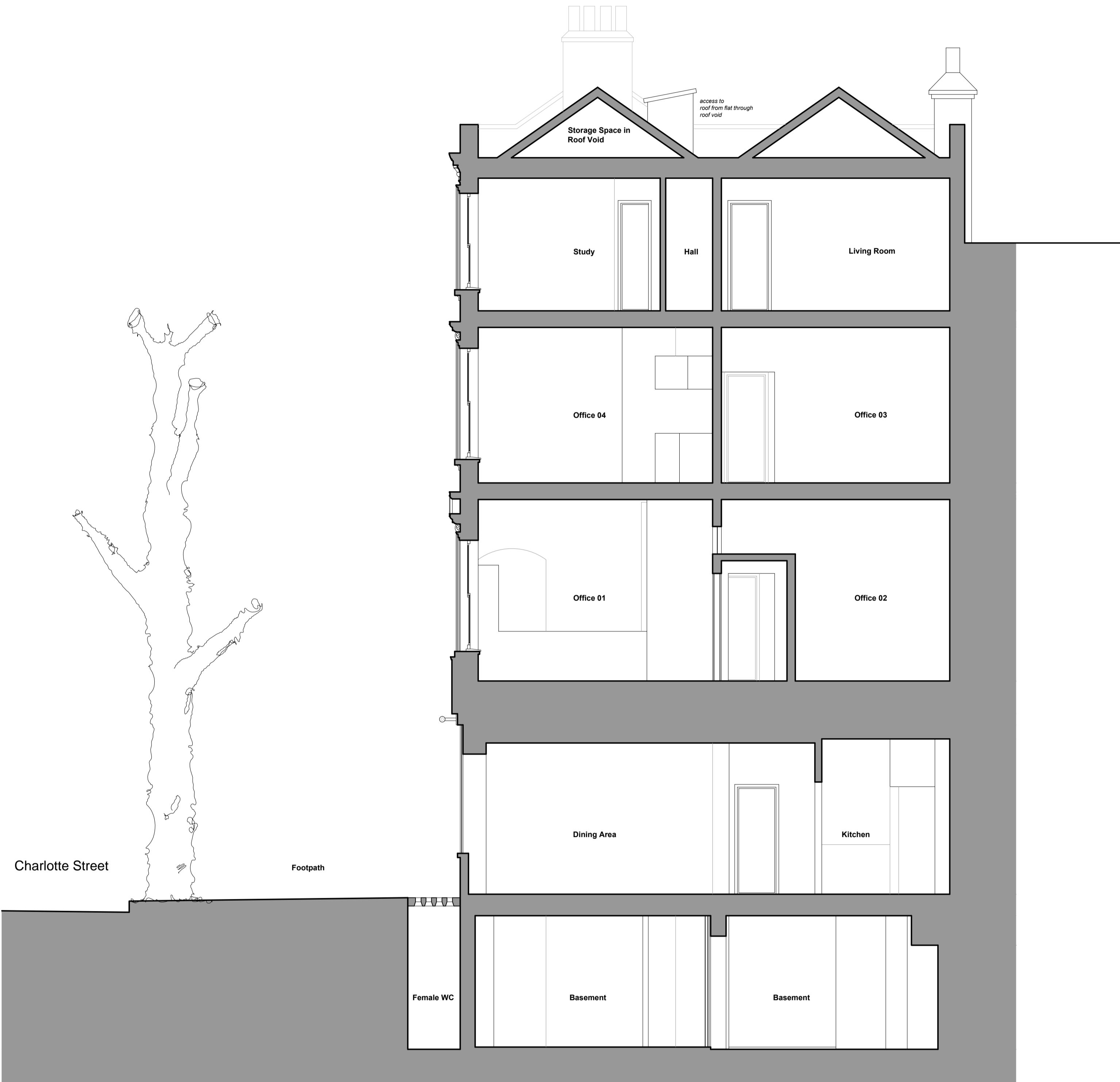
Cross Section B-B 1:50 @ A1