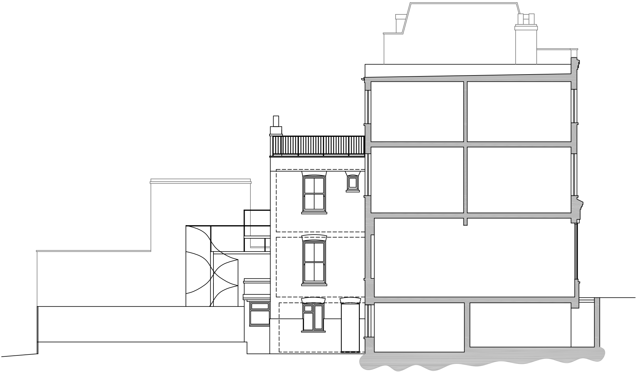
SIDE ELEVATION & SECTION

ALL WORK TO BE TO CLIENT & LOCAL AUTHORITY APPROVAL. ALL RELEVANT BS'S & CP'S TO BE COMPLIED WITH. ANY DISTURBANCE TO BE MADE GOOD TO MATCH EXISTING. ARCHITRAVES, CORNICES, DOORS & SKIRTINGS TO MATCH. SERVICES TO BE ALTERED & EXTENDED AS NECESSARY.