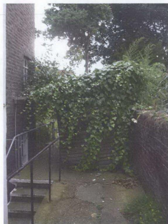
11 PRIORY ROAD- EXISTING SHED TO BE REMOVED