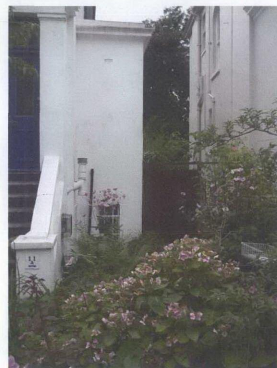
11 PRIORY ROAD- SIDE PASSAGE GATE, TO BE REPLACED