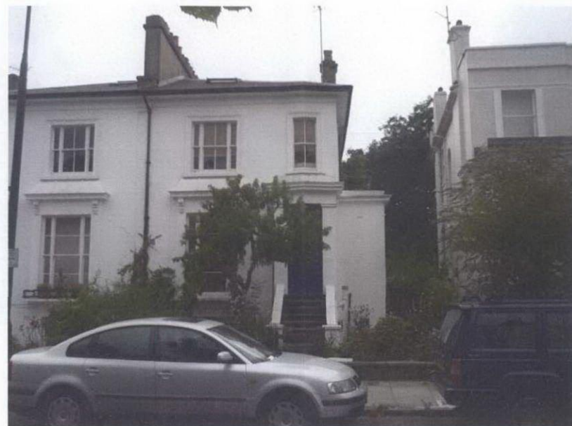
FRONT ELEVATION- 11 PRIORY ROAD