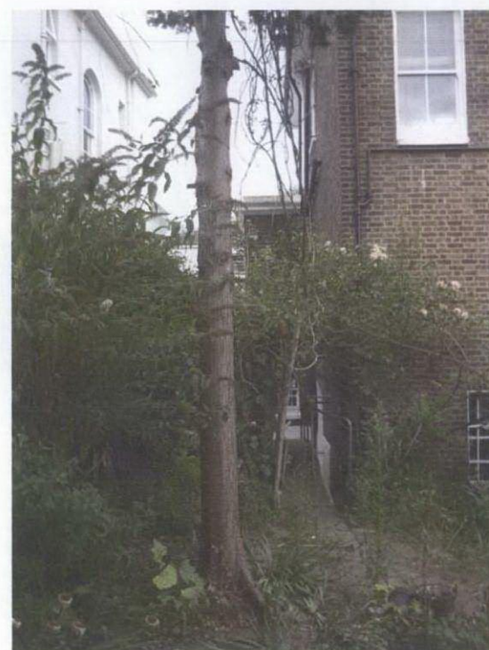
11 PRIORY ROAD- LOCATION OF PROPOSED SIDE EXTENSION