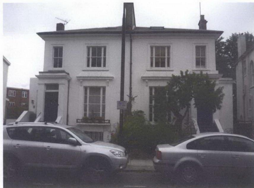
FRONT ELEVATION- 9 AND 11 PRIORY ROAD