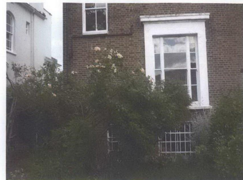
REAR ELEVATION- 11 PRIORY ROAD