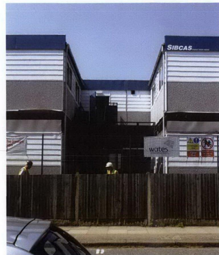
Staircase in situ