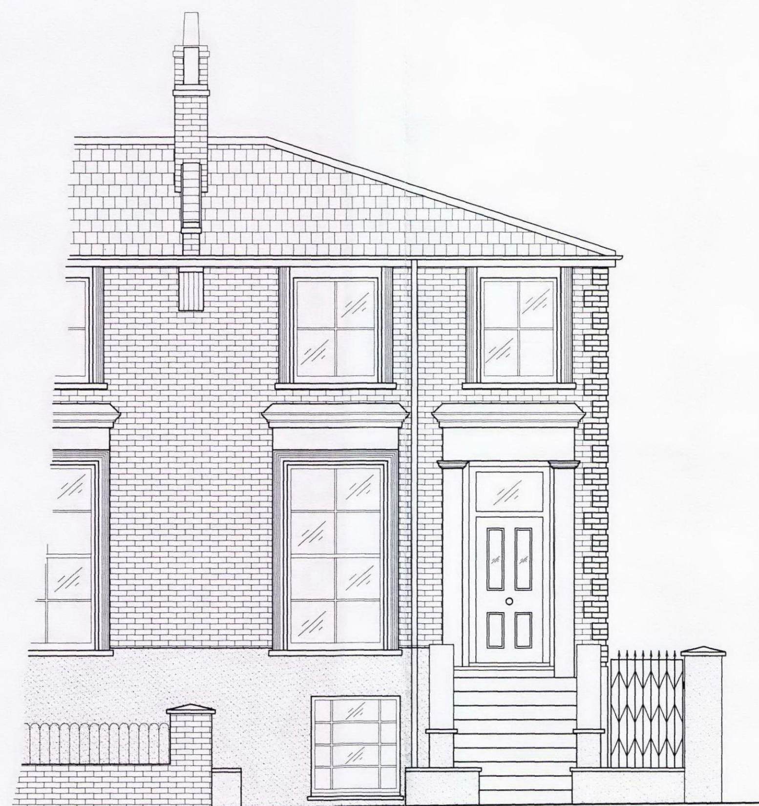
Front Elevation scale 1:50

1. This drawing and the following notes to be read in conjunction with all relevant Architects, Engineers & Specialist drawings and specifications.