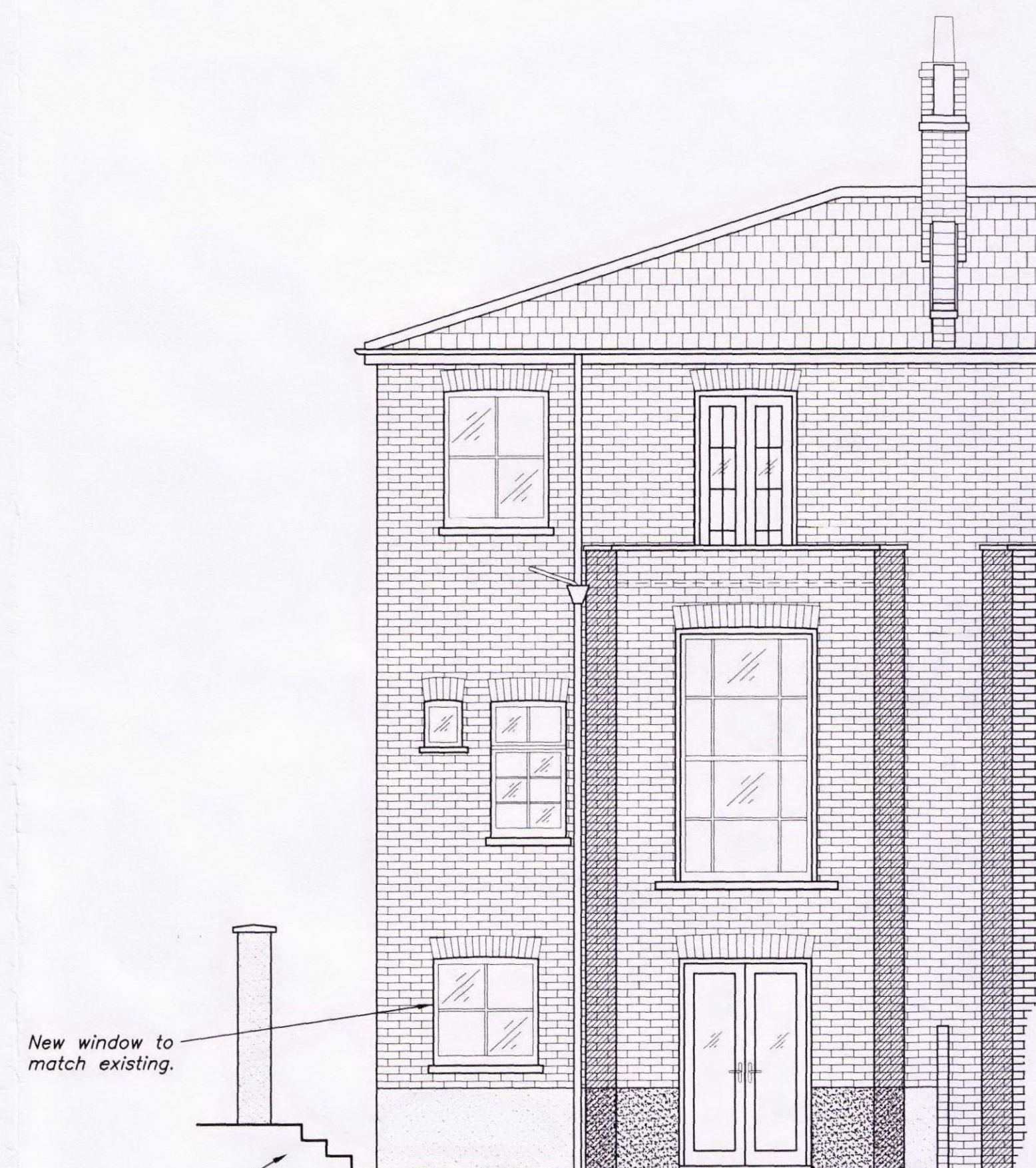
Rear Elevation scale 1:50