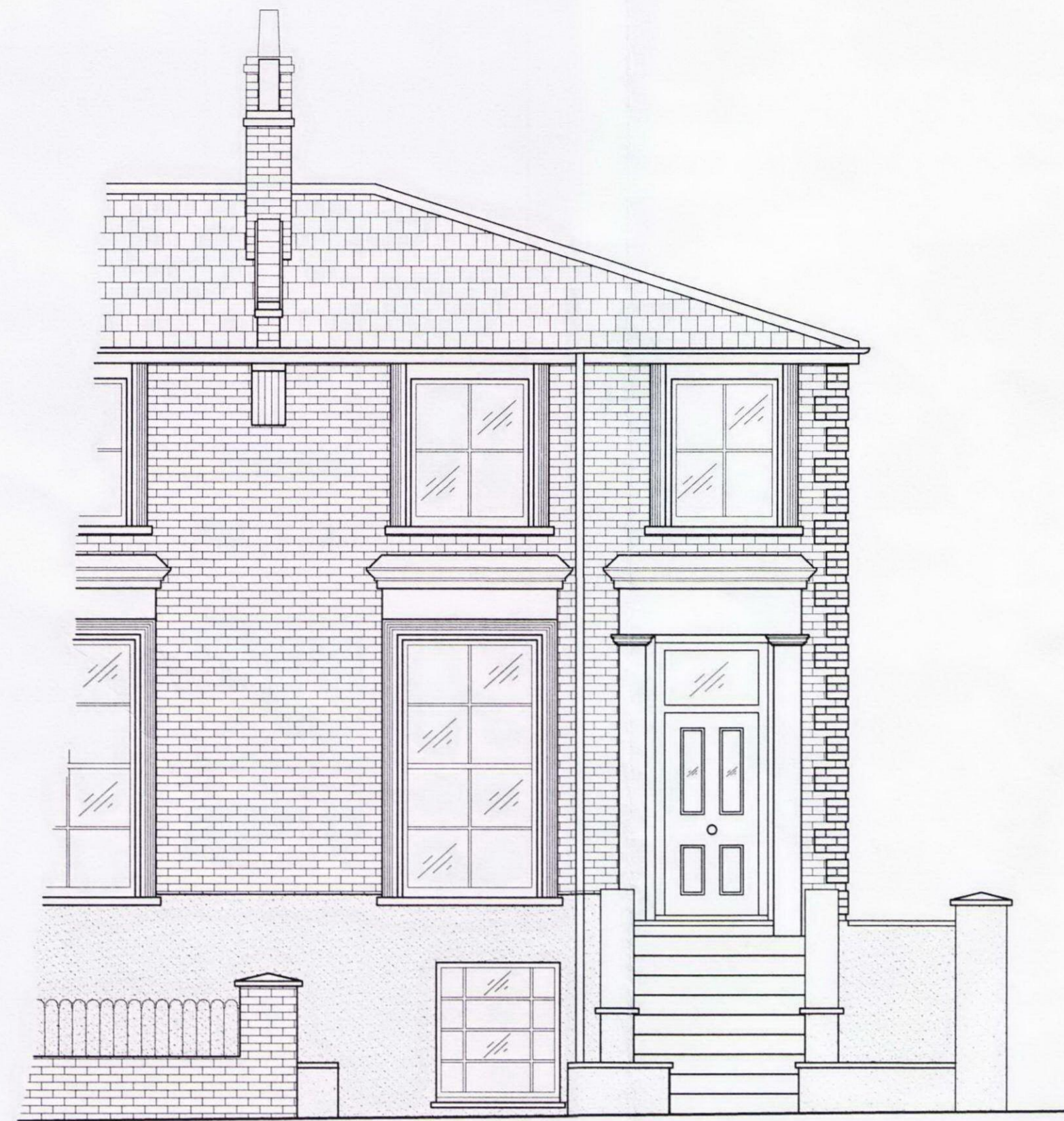
Front Elevation scale 1:50

Notes : 1. This drawing and the following notes to be read in conjunction with all relevant Architects, Engineers & Specialist drawings and specifications.