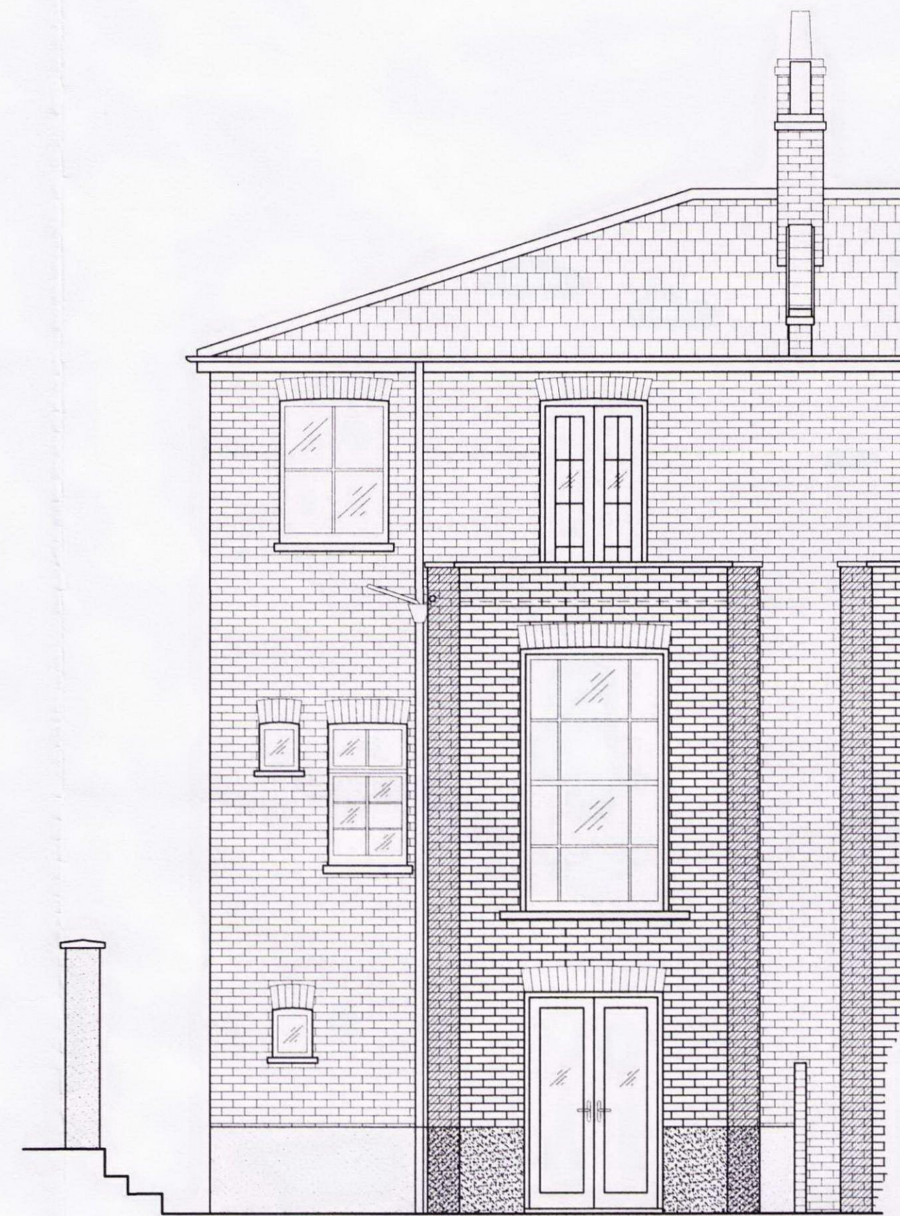
Rear Elevation scale 1:50