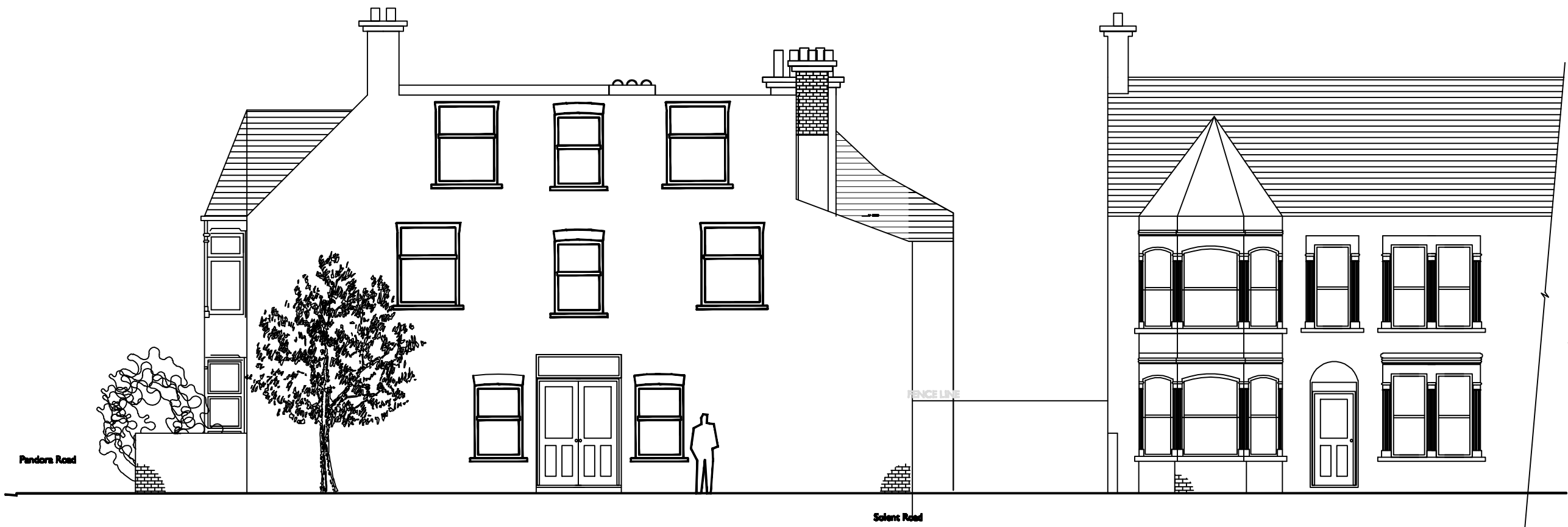
PROPOSED SIDE ELEVATION 38 Pandora Road, London, NW6 1TR