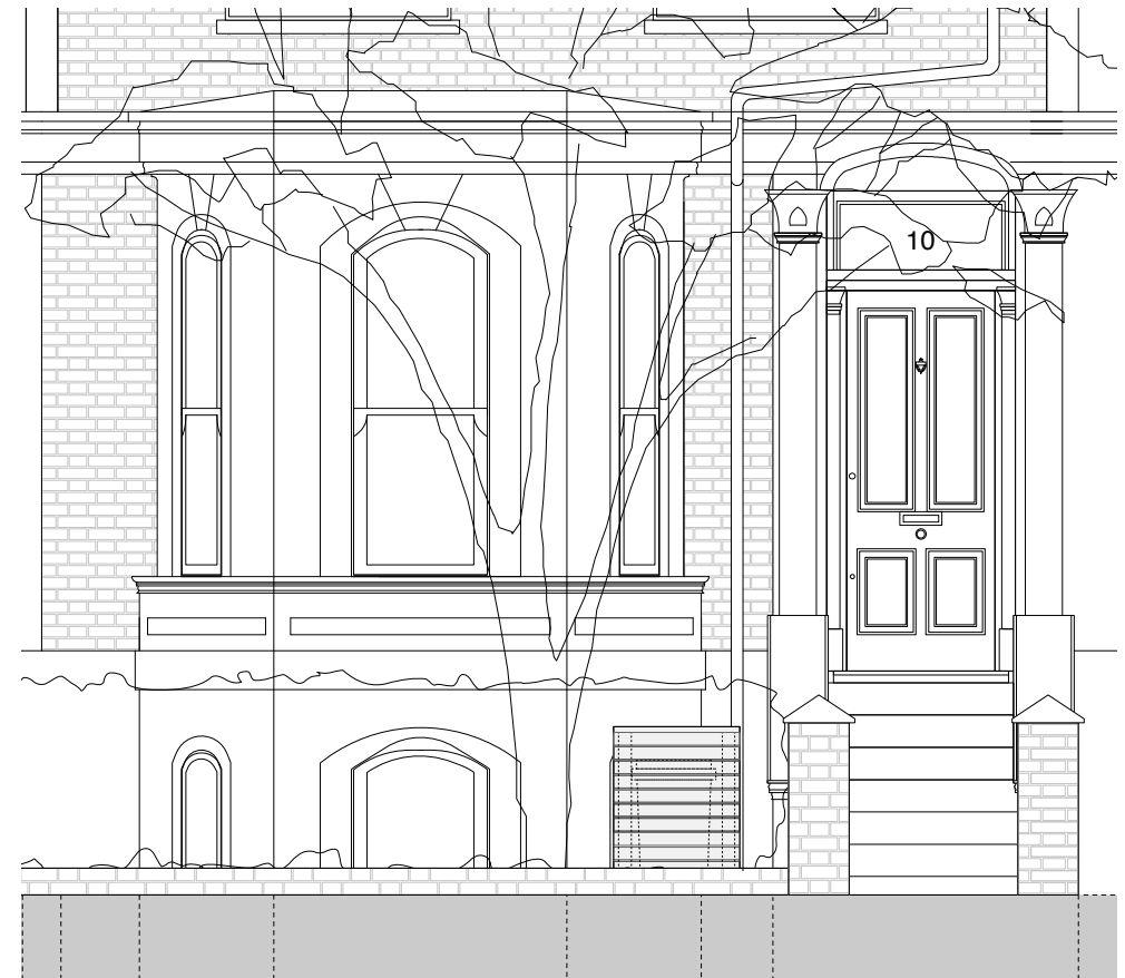
Laurier Road Elevation