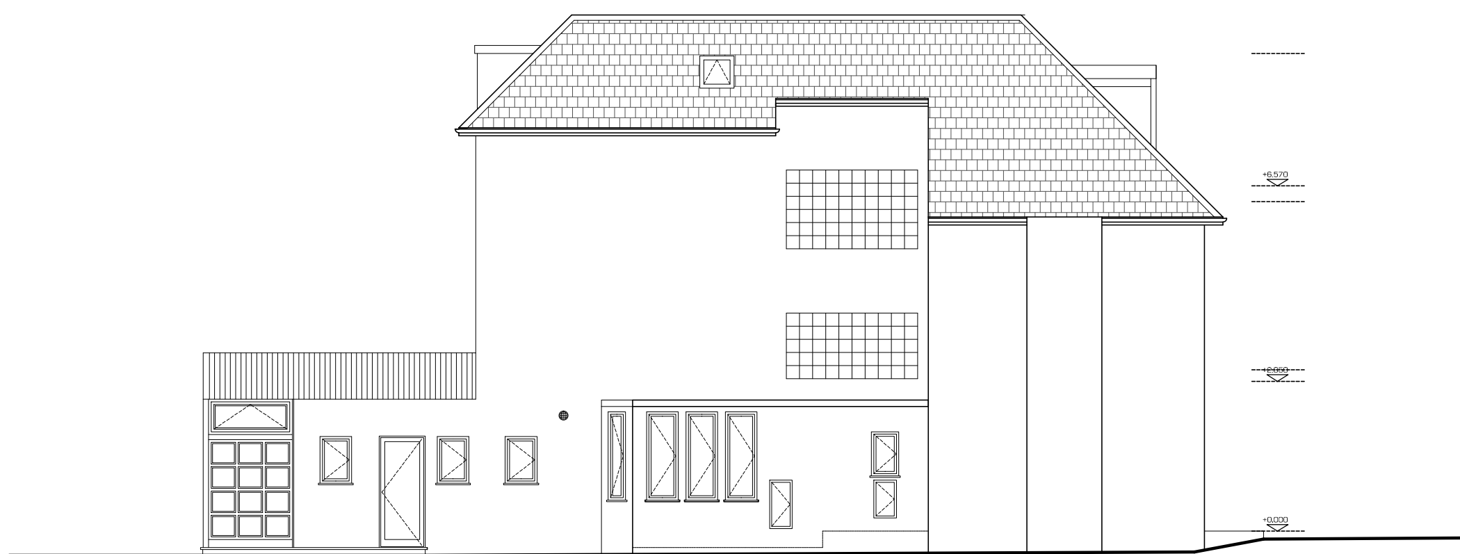
Existing Side Elevation Scale 1:100