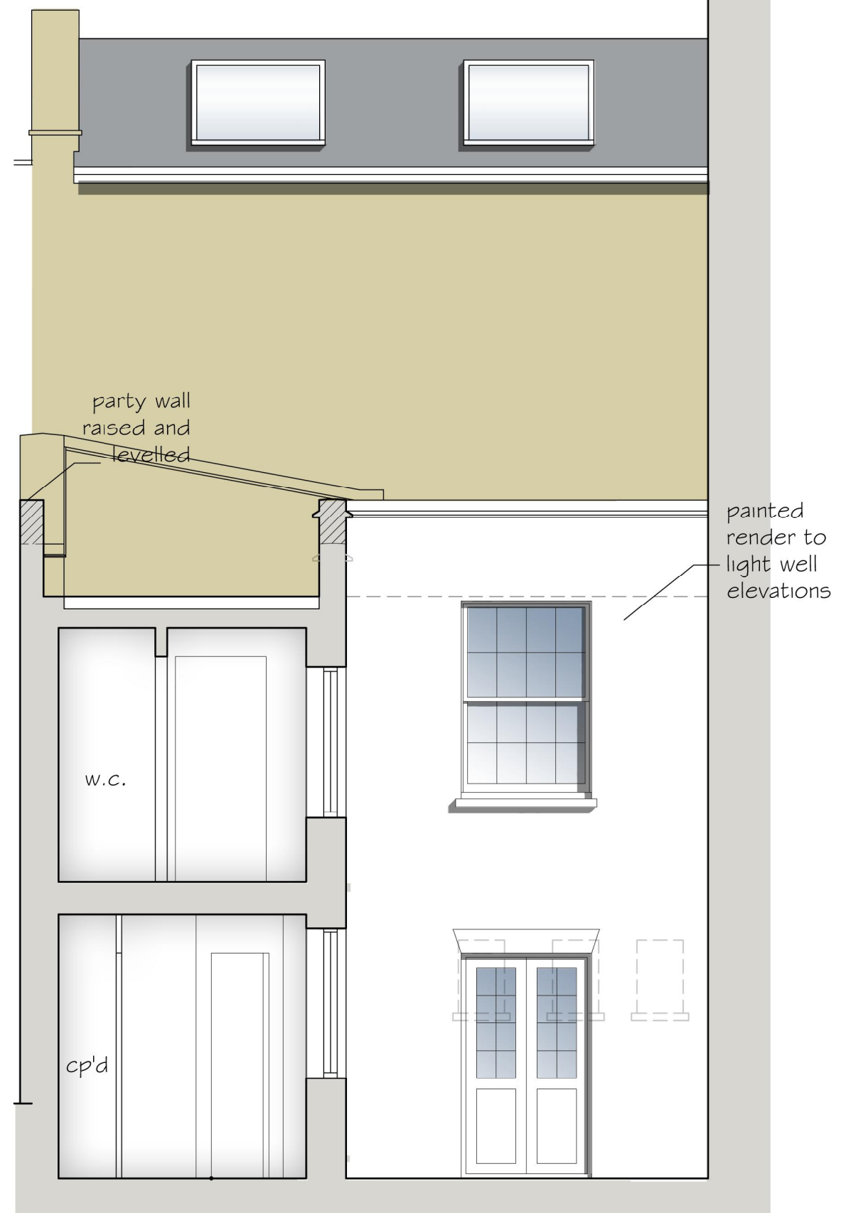
Section A-A proposed