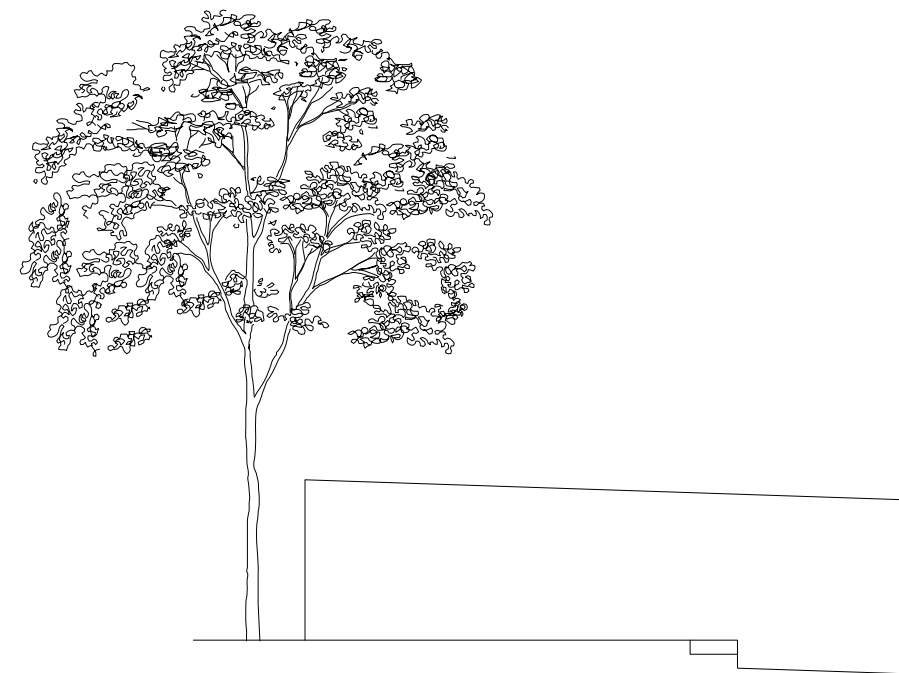
03 Side Elevation