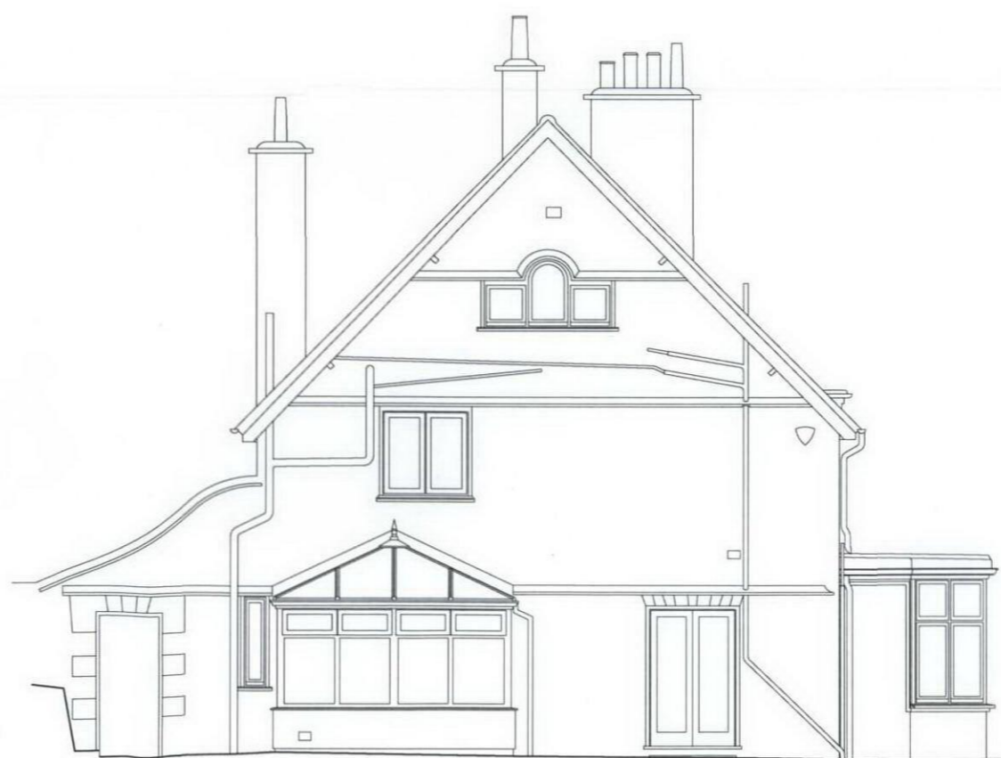
EAST ELEVATION (SIDE)