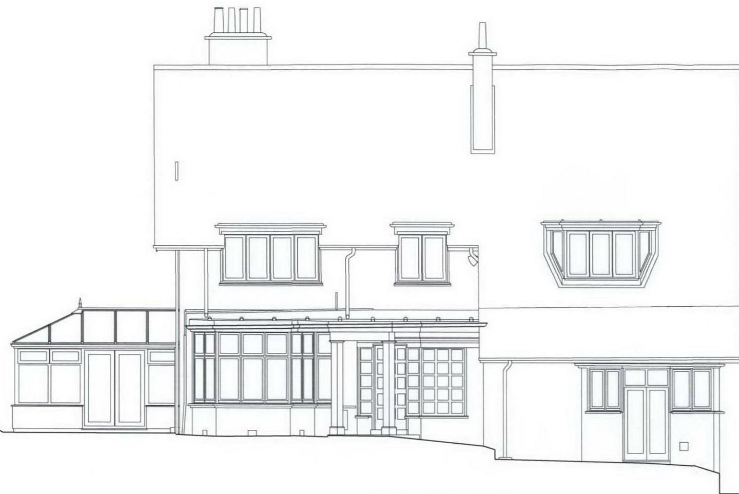
NORTH ELEVATION (FRONT)