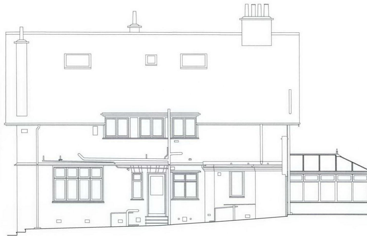
SOUTH ELEVATION (REAR)