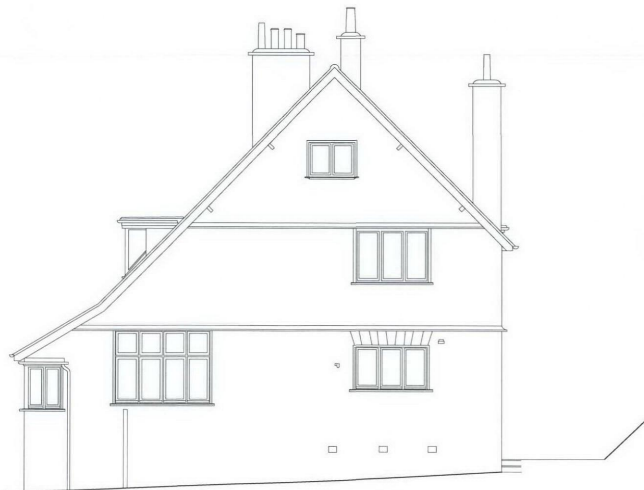
WEST ELEVATION (SIDE)