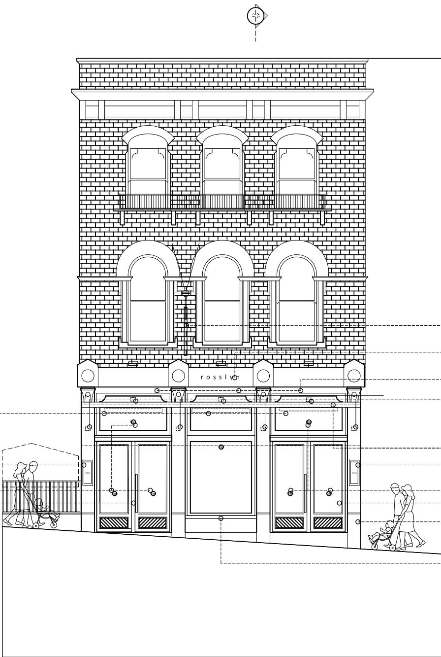
proposed elevation to rosslyn hill ( awning up )