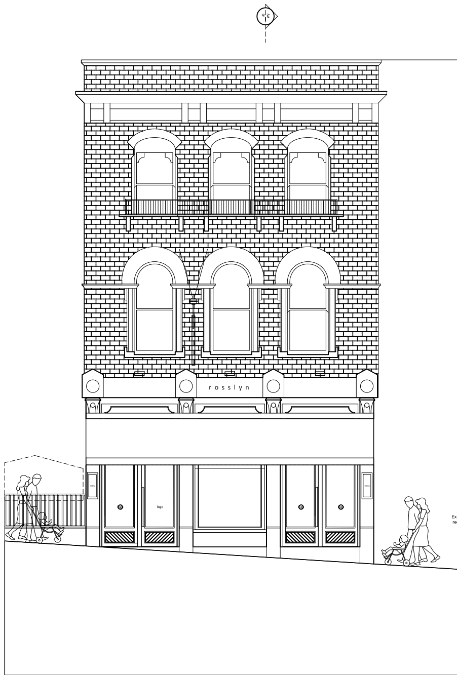
proposed elevation to rosslyn hill ( awning down )