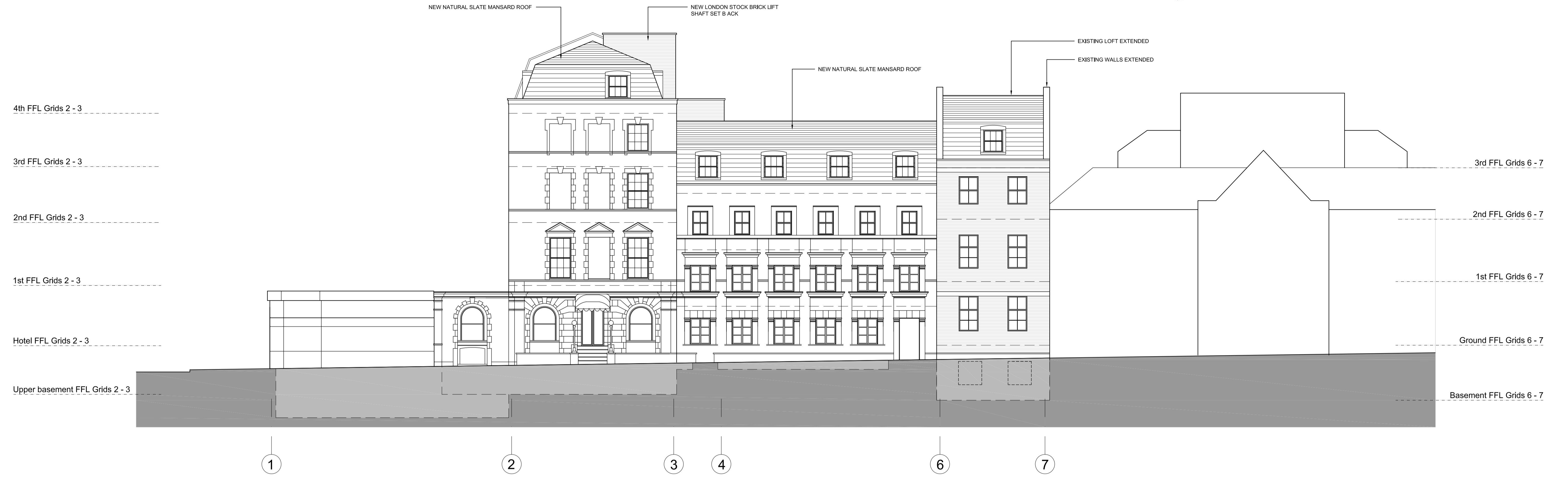
CRESTFIELD STREET ELEVATION