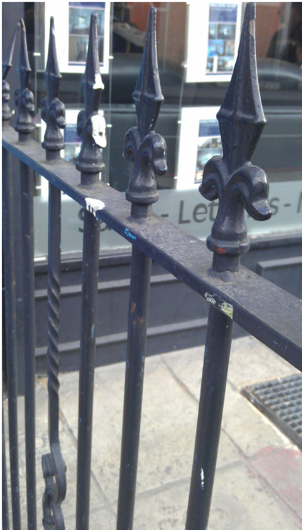
3A View of Existing Railing