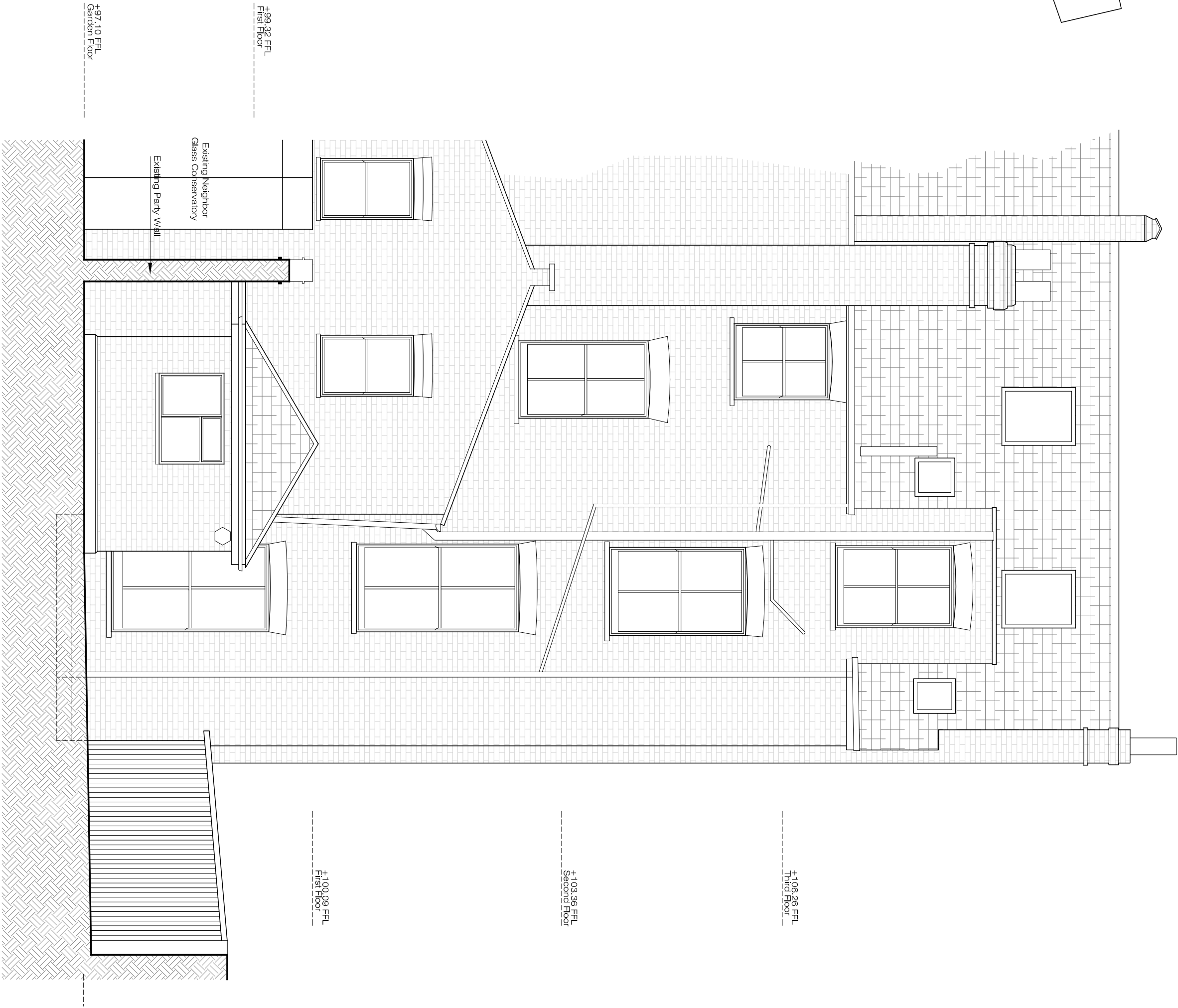
EXISTING REAR ELEVATION SCALE 1:50@A2 Ex-03