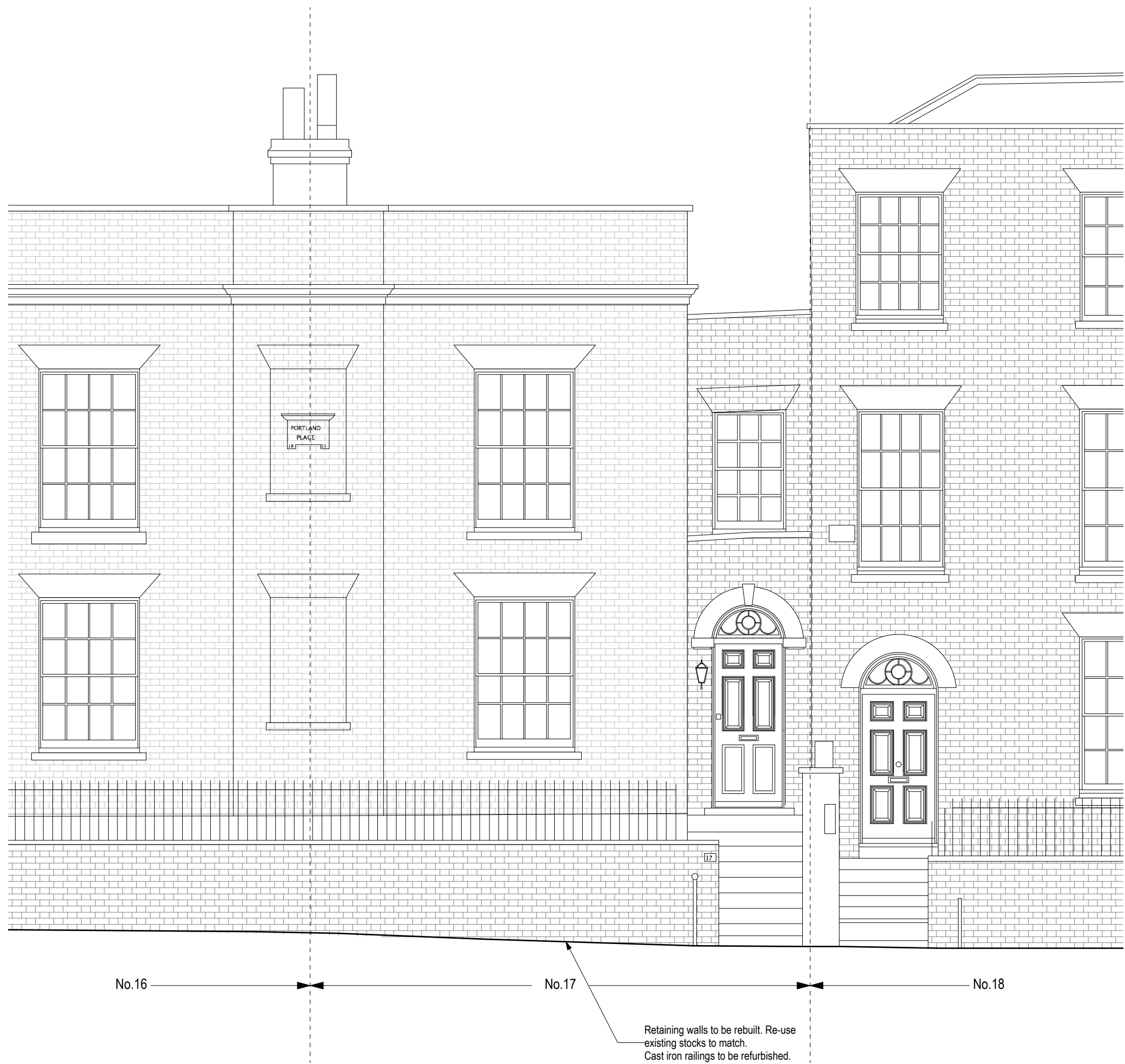
01 SOUTH-EAST ELEVATION (FRONT) - PROPOSED