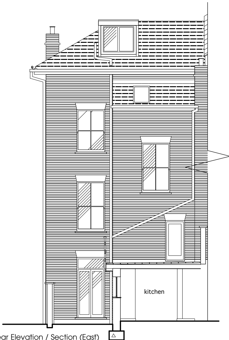
Existing Rear Elevation / Section (East)