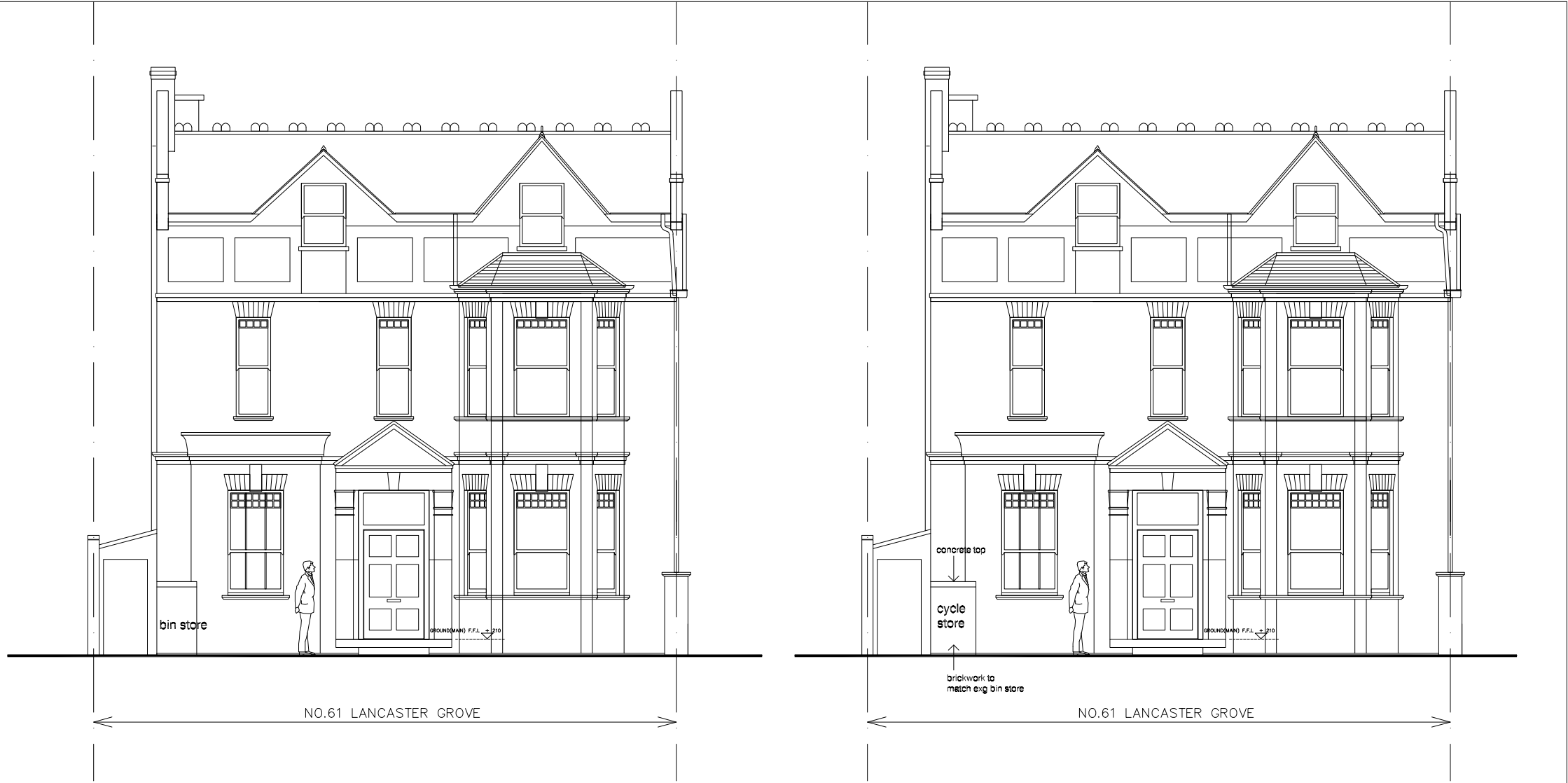
front elevation as existing