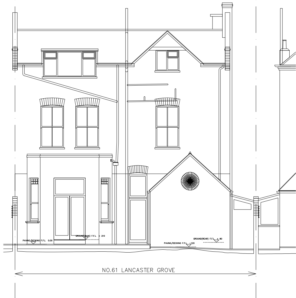
rear elevation as existing