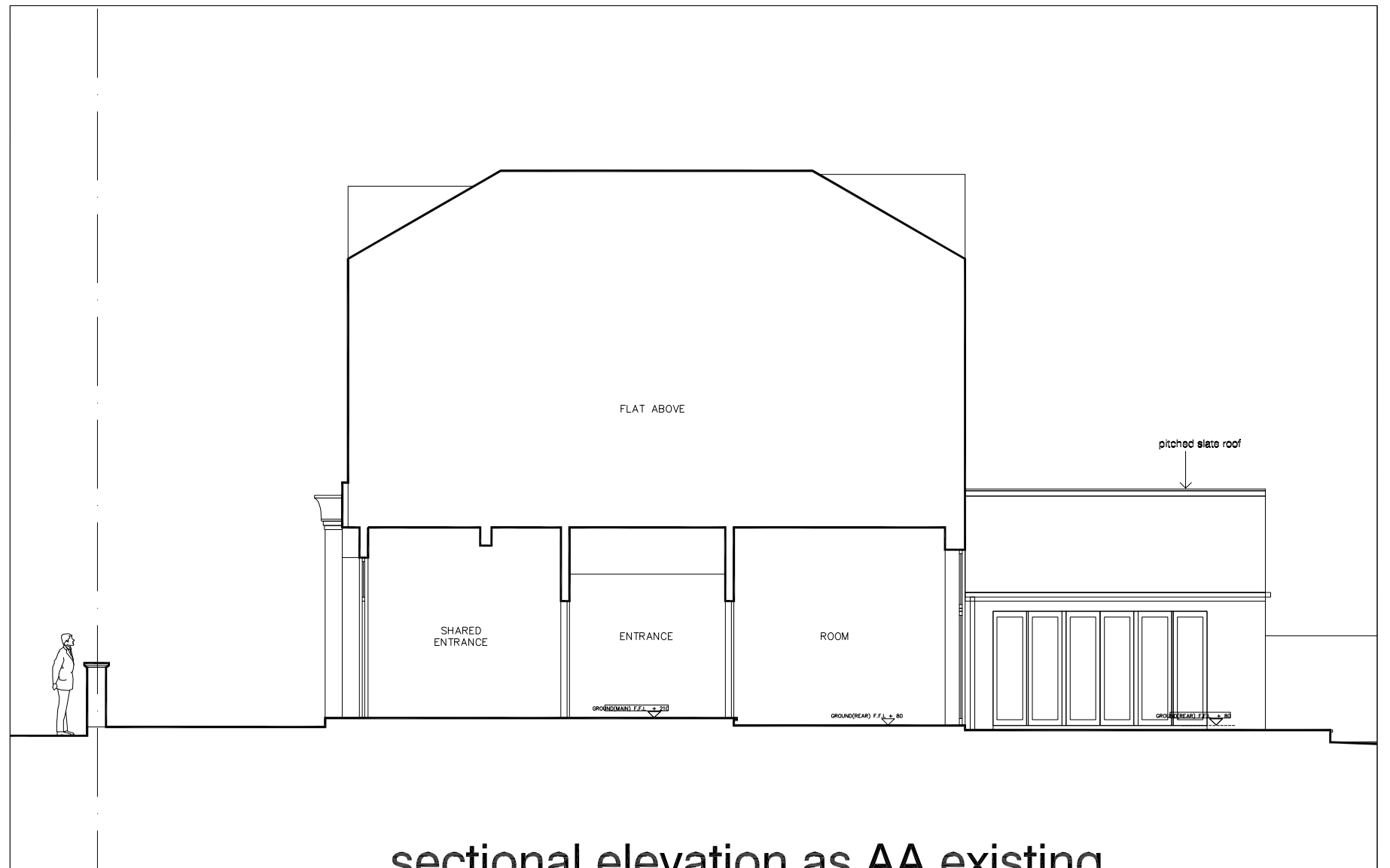
sectional elevation as AA existing