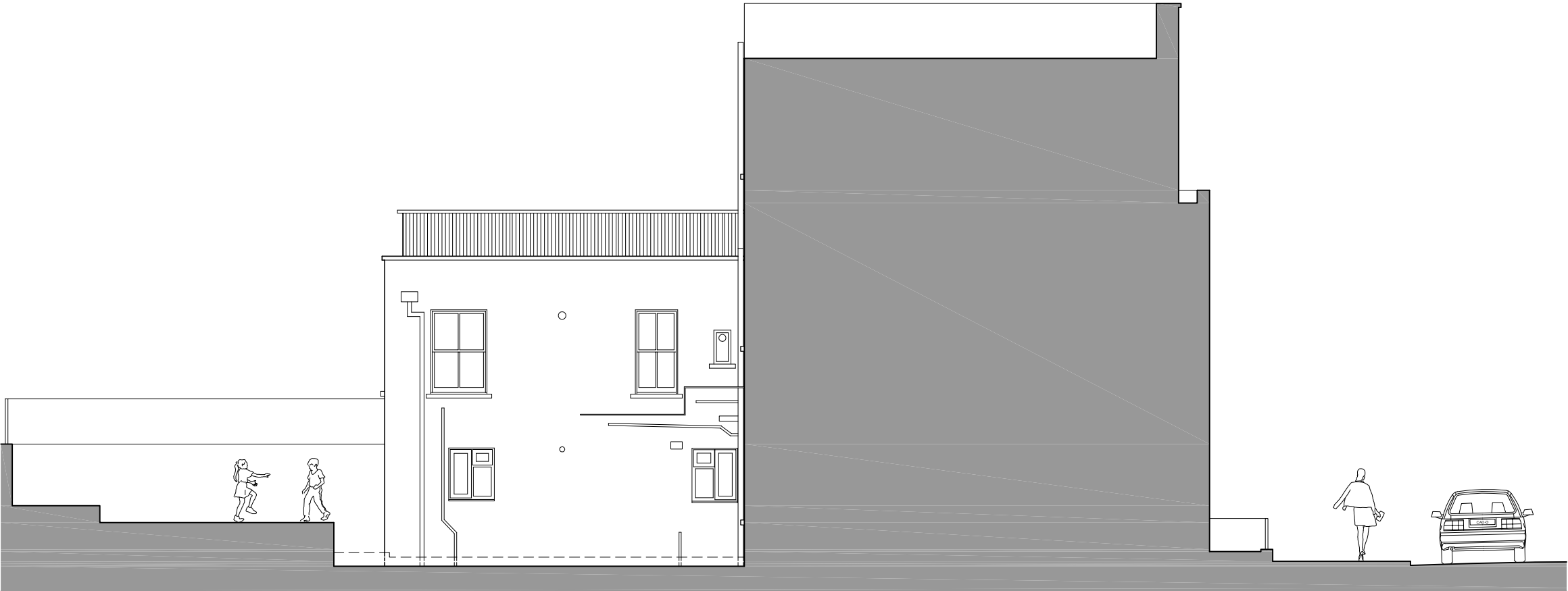
+EL Existing side elevation- scale 1:50