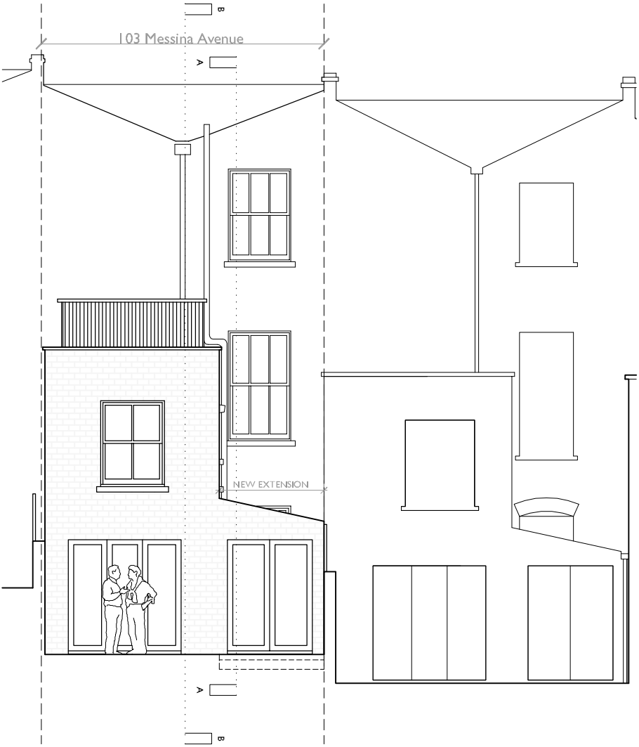
+EL Proposed rear elevation- scale 1:50