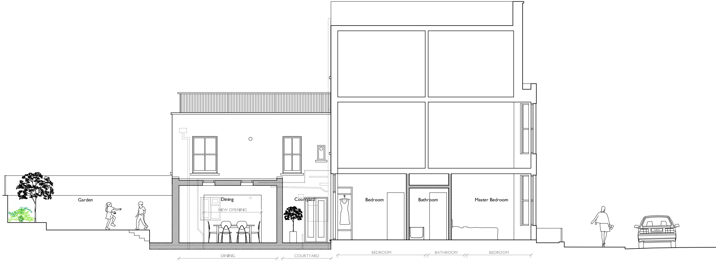
+SX Proposed section AA - scale 1:50