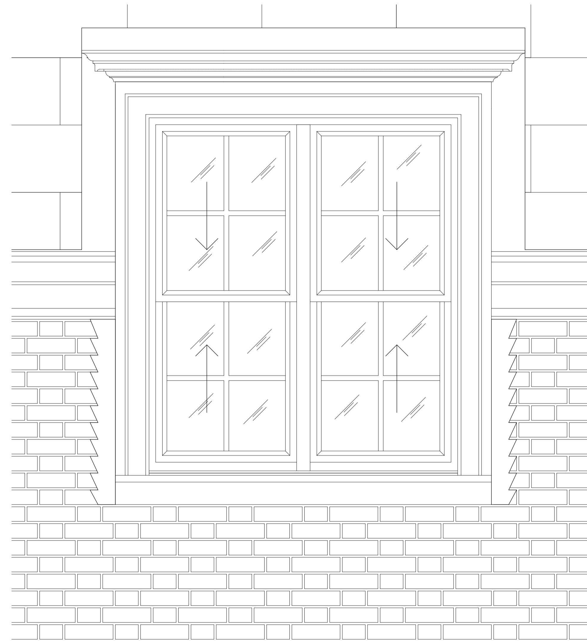
4 SCALE 1:10 @ A1 / 1:20 @ A3 BEDROOM 4 DORMER WINDOW ELEVATION

DO NOT SCALE FROM THIS DRAWING Figured dimensions only are to be taken from this drawing. All dimensions are to be checked on site before any work is put in hand. If in doubt, ask.