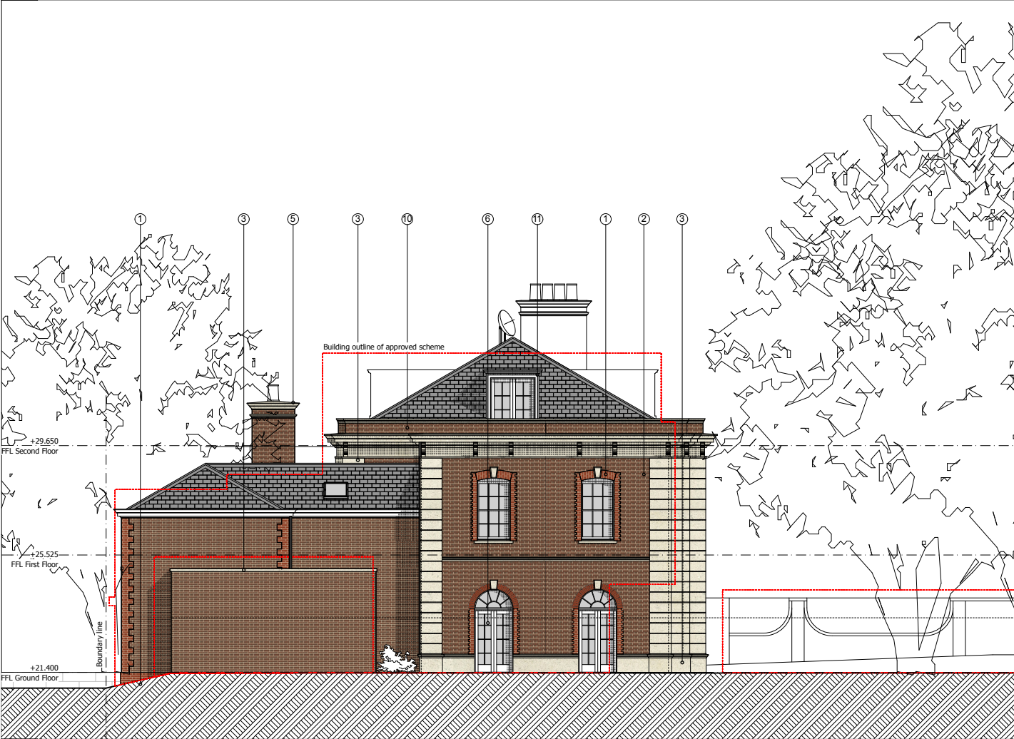
2 SOUTH WEST ELEVATION