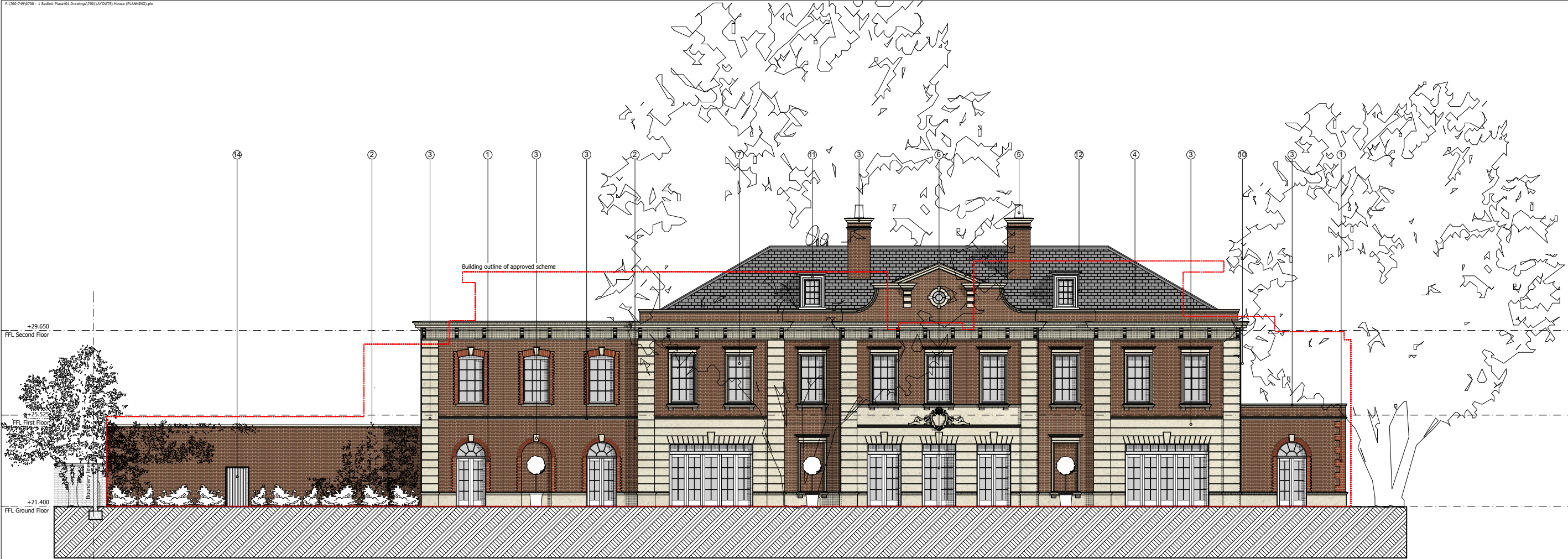
1 SOUTH EAST ELEVATION