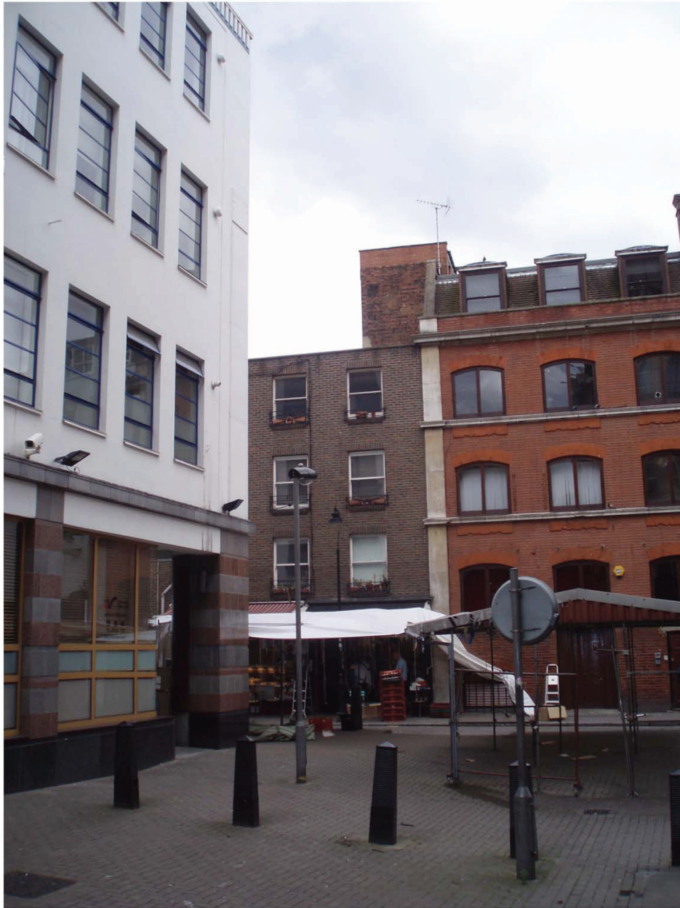
VIEW FROM BEAUCHAMP STREET