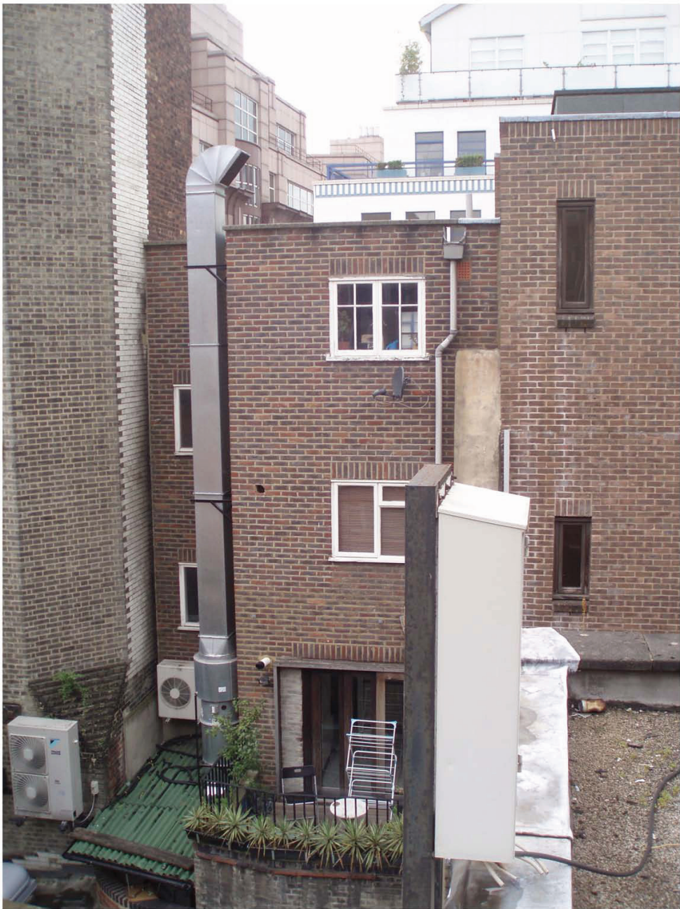
VIEW FROM TO THE REAR