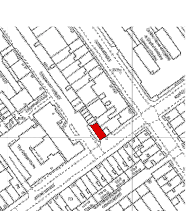
AREA OF PROPOSED BYRON SHOPFRONT 1:1000 @ A1