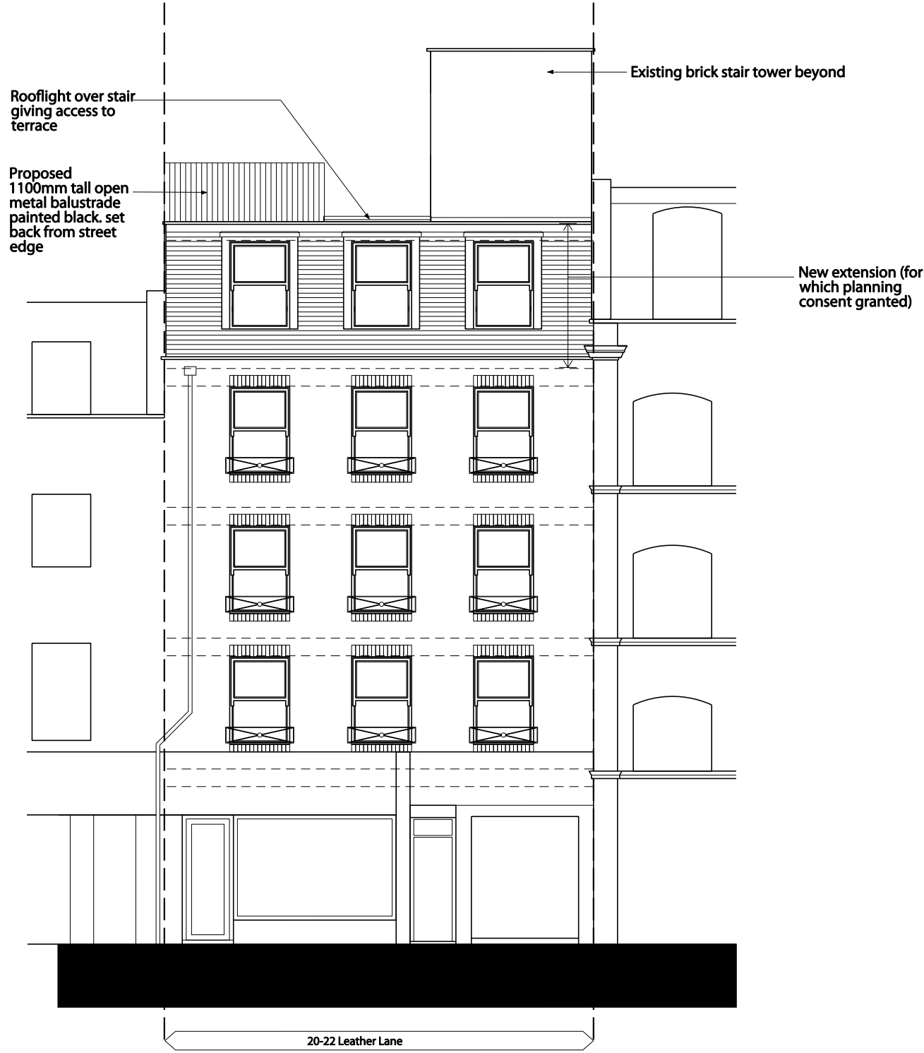
Proposed Front Elevation onto Leather Lane