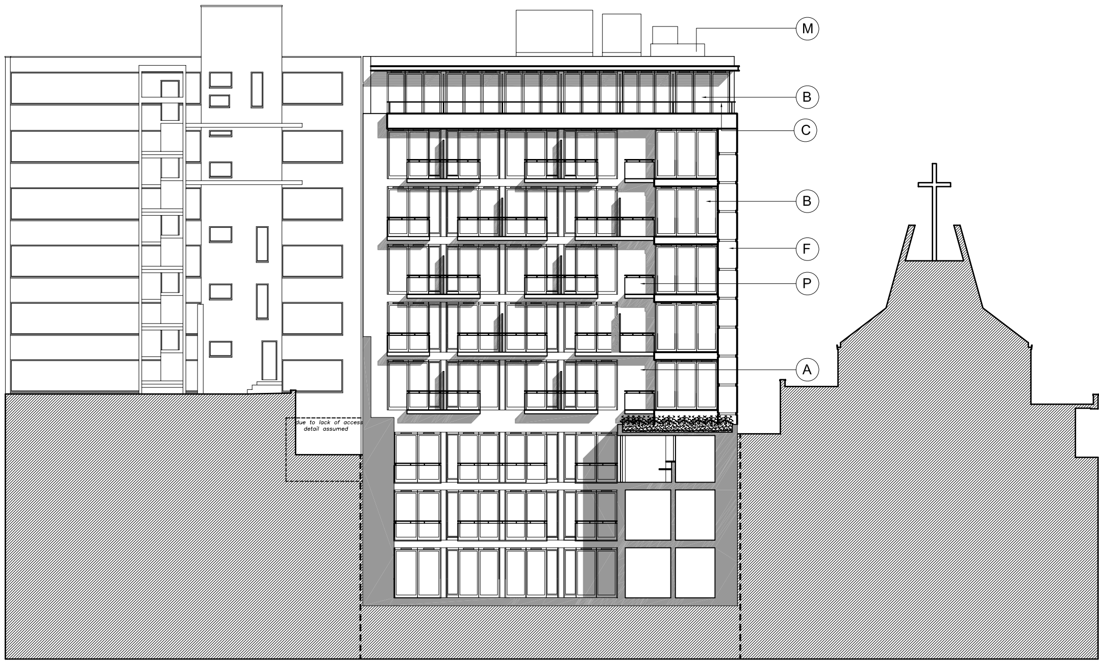
COURTYARD WEST ELEVATION F FRD-PL-305