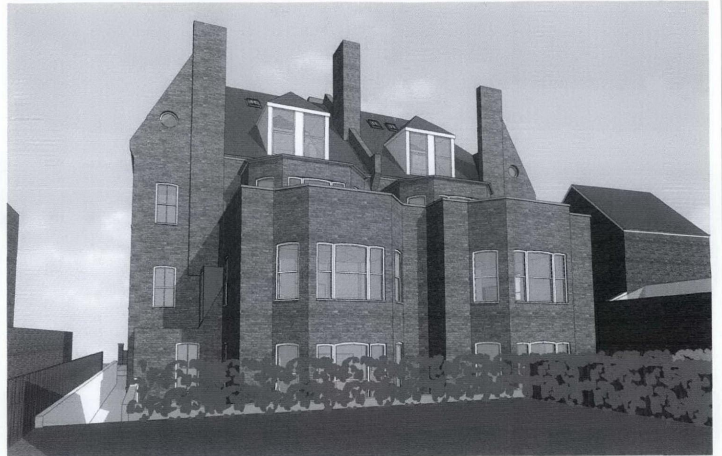
02. VIEW FROM GARDEN OF NO.5 ROSSLYN HILL