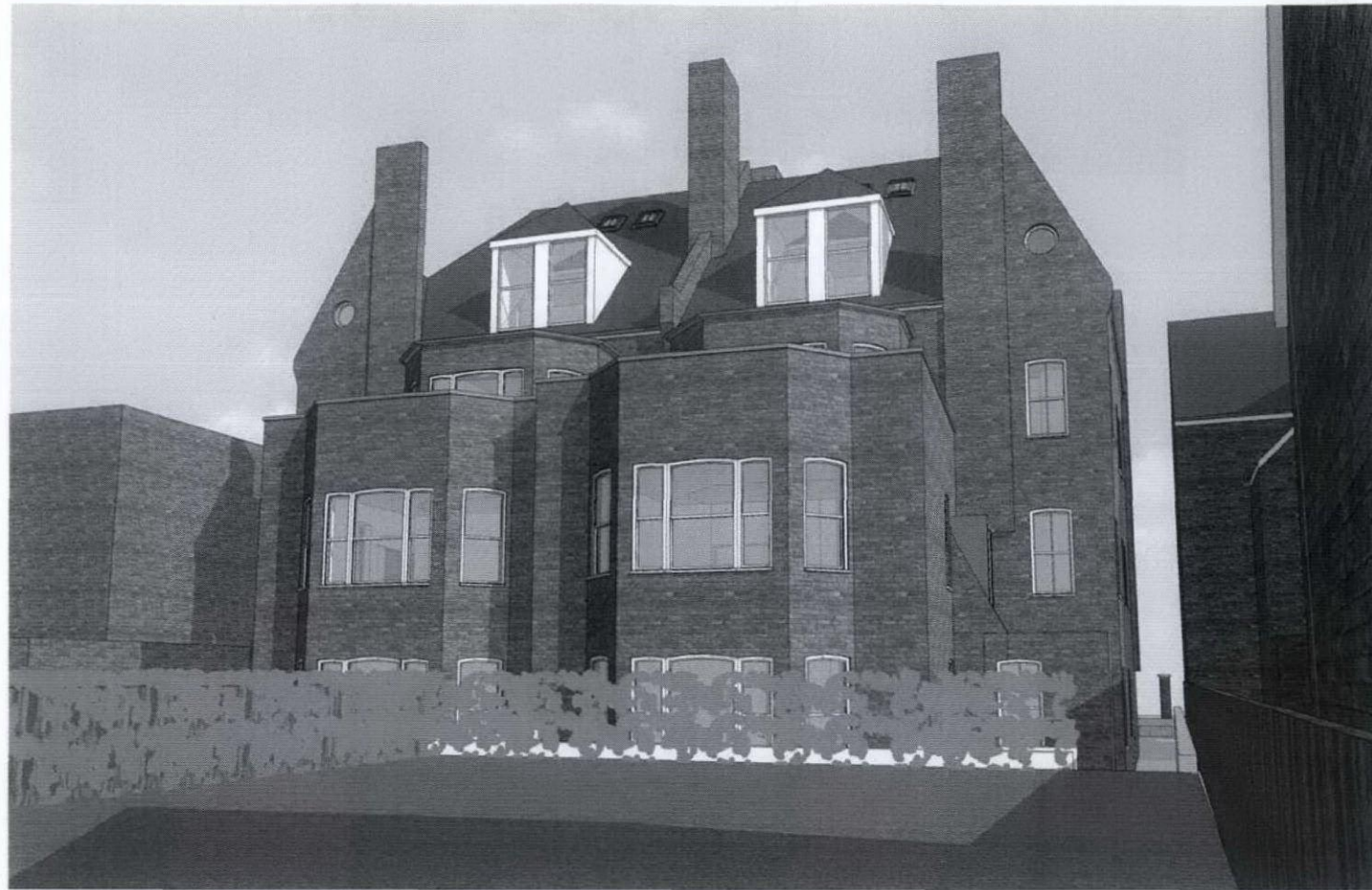
01. VIEW FROM GARDEN OF NO.3 ROSSLYN HILL