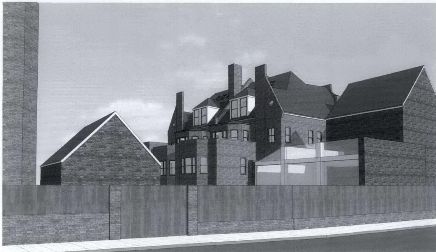
03. STREET LEVEL VIEW FROM BELSIZE LANE