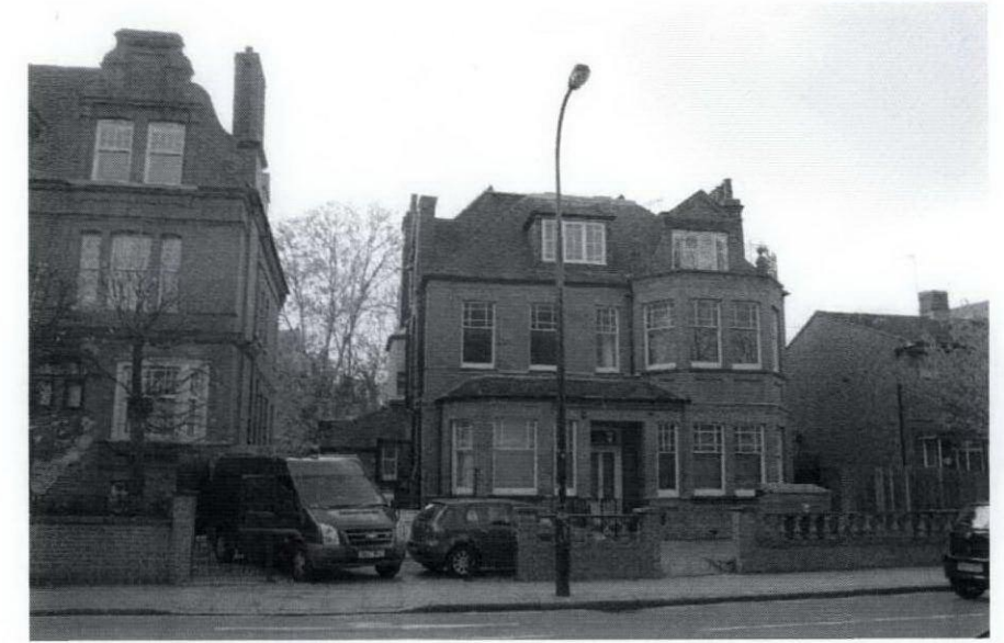
03 7 ROSSLYN HILL