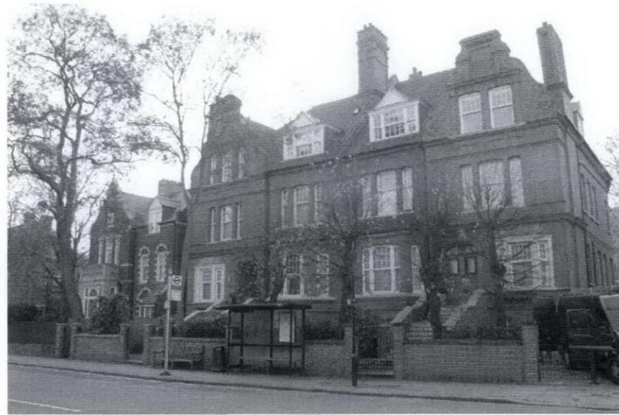
02 3 & 5 ROSSLYN HILL