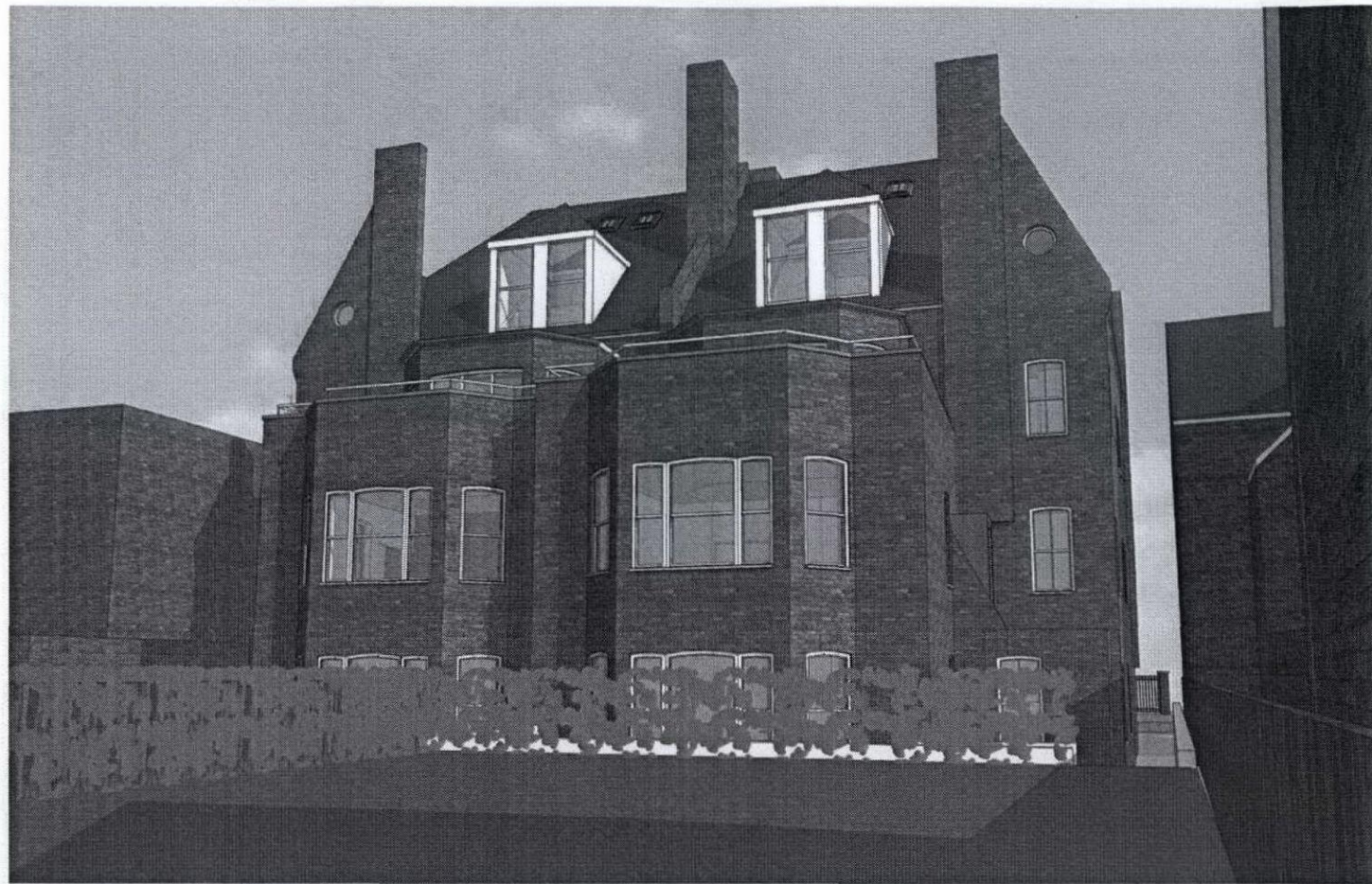
01. VIEW FROM GARDEN OF NO.3 ROSSLYN HILL