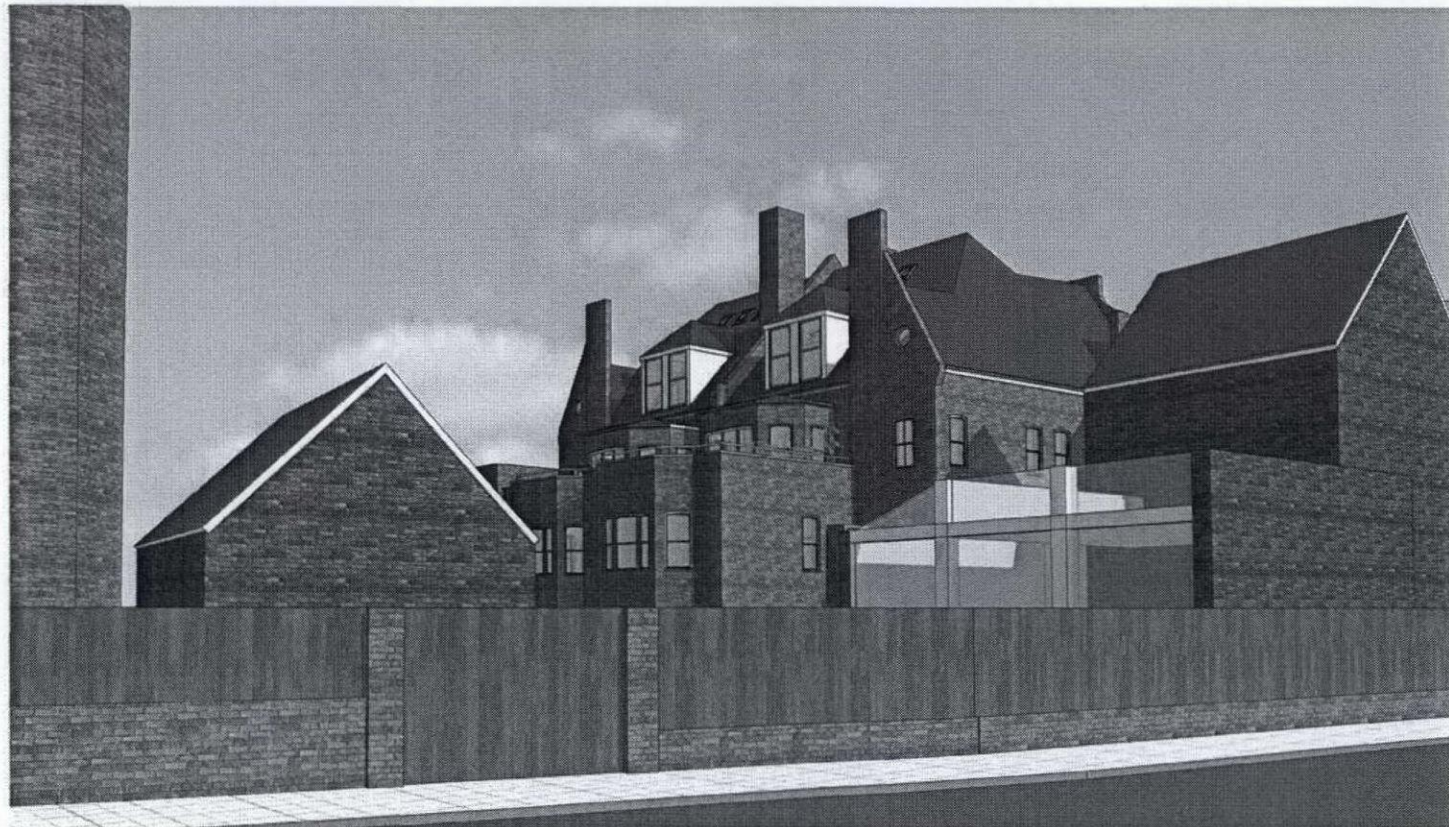
03. STREET LEVEL VIEW FROM BELSIZE LANE