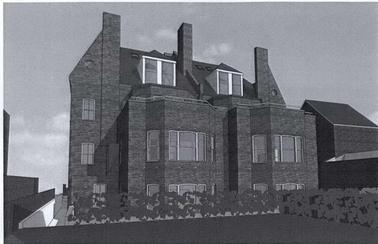
02. VIEW FROM GARDEN OF NO.5 ROSSLYN HILL