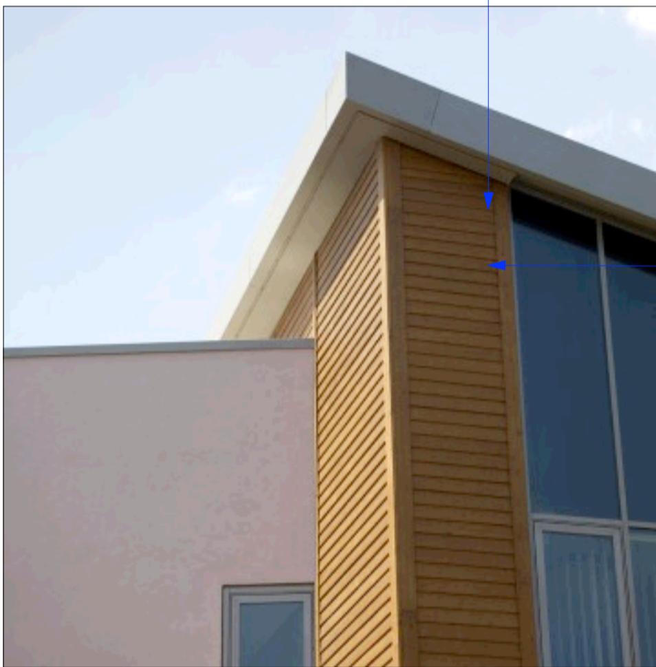
INDICATIVE IMAGE OF PROPOSED TIMBER CLADDING, INSTALLED IN HOSPITAL BUILDING