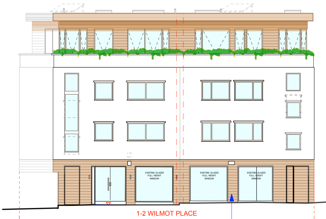
PROPOSED FRONT ELEVATION, SHOWING NEW HEAT TREATED TIMBER CLADDING AT GROUND FLOOR AND AT NEW EXTENSION LEVEL

THOR Torrefied Wood is a natural heat treated solid wood cladding product that has a 60 year warranty against decay. Torrefaction is a 100% natural process that involves prolonged, high temperature treatment of wood reaching 200° C making it amazingly durable and stable.