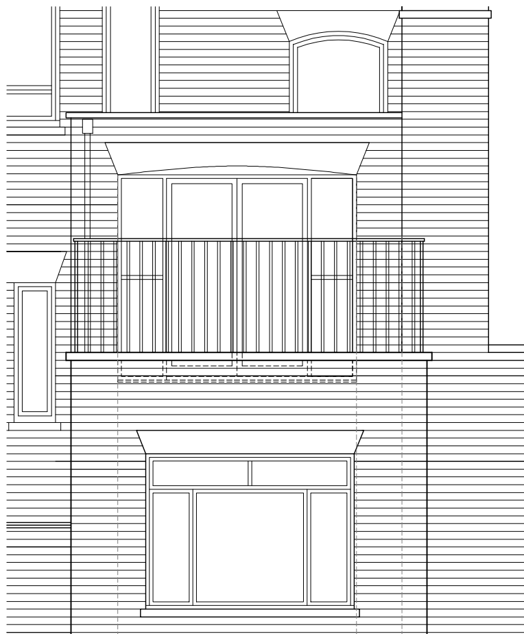
PART PROPOSED REAR ELEVATION-to show relationship with proposed plan 1:50@A3

New timber patio doors and sidelights in new extension; extent of new extension identical to existing