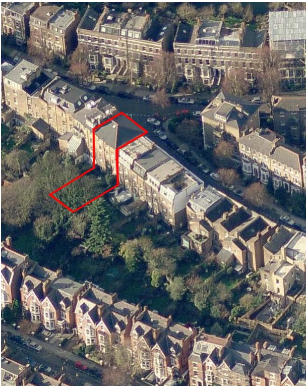
Aerial view of rear of application site facing East (outlined in red)