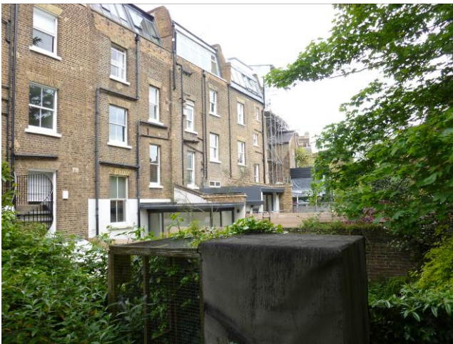
Showing existing extensions to neighboring properties