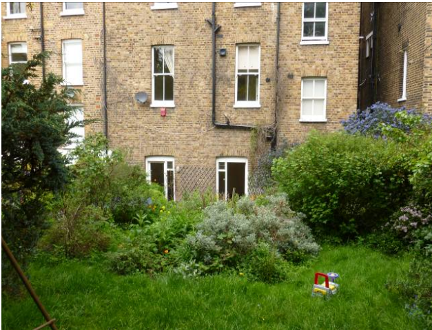
Existing rear elevation (ground & first floors)