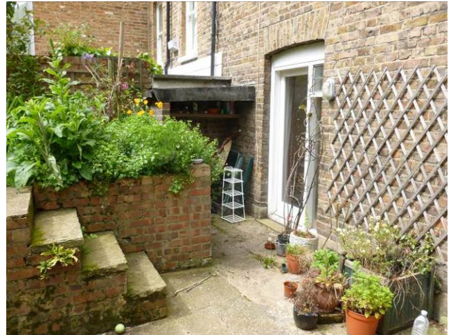
Existing Rear Yard