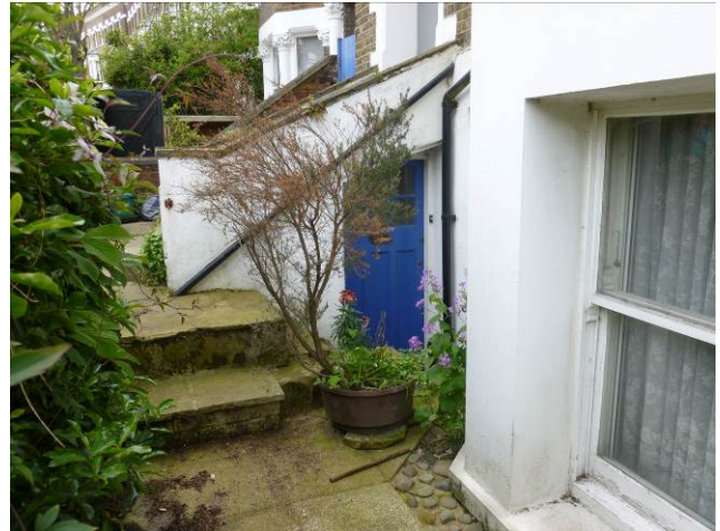
Existing external access to basement level