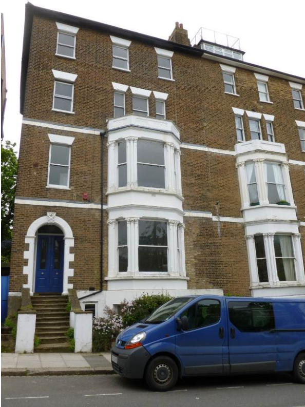
Existing façade of application site