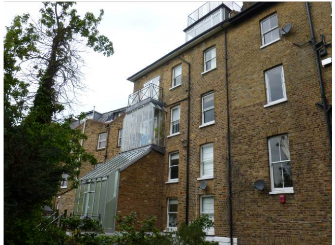
Existing extension to neighboring 45 South Hill Park