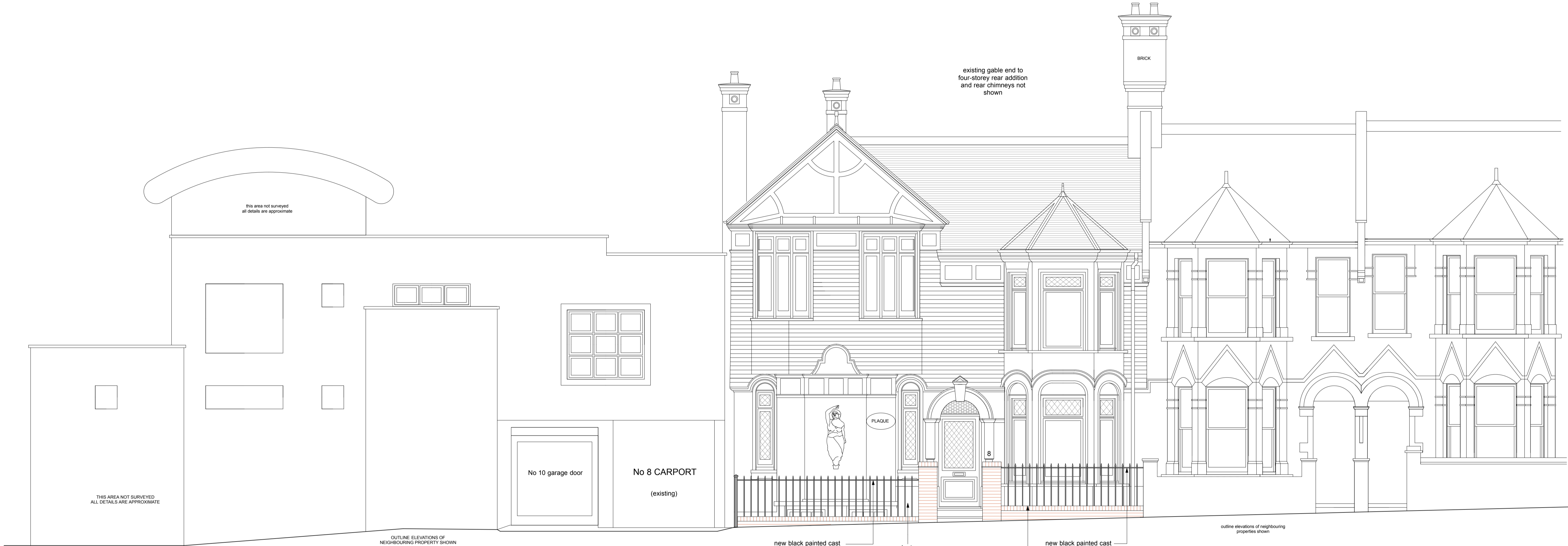
No 10 PILGRIMS LANE